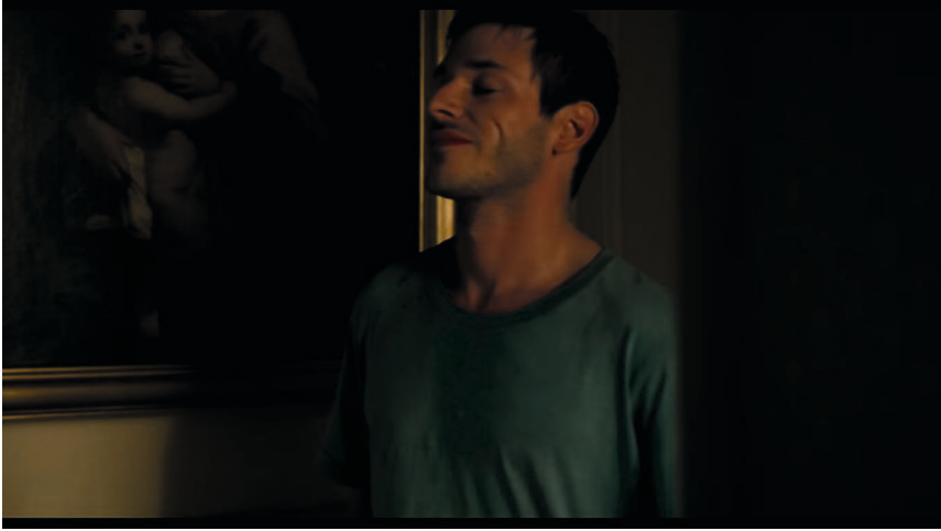
8 IL ÉTAIT UNE SECONDE FOIS (2019): Nursing Madonna: The Pre-Oedipal Dyad

around ‘the Thing’: “le truc” 38 . Even though the characters seem to use the word as a reference to a party drug, I would argue that the general isotopy of excessive enjoyment produced by the orgasm and the excess of the party as well as the logic of the mother-child-dyad evoked by the painting favour a secondary reading of le truc in psychoanalytical terms, namely as the notion of das Ding . 39 The concept of das Ding refers to the pre-symbolic/pre-oedipal, maternal thing as the incarnation of an impossible jouissance (enjoyment). It is basically the subject’s retroactive imagination of an uncorrupted enjoyment in symbiosis with the mother before the castrative intervention of the father. The point is of course that the “symbolic prohibition of enjoyment in the Oedipus complex (the incest taboo) is [...], paradoxically, the prohibition of something which is already impossible” 40 . However, why does the series so firmly emphasize the pre-oedipal logic of its establishing scene? How could the painting of the Madonna and Jesus be connected to the Black Square – the fissure in diegetic ‘reality’ – or even to the yellow vest protest? In order to fully grasp the function of sex, enjoyment, and the painting in the opening scene, I