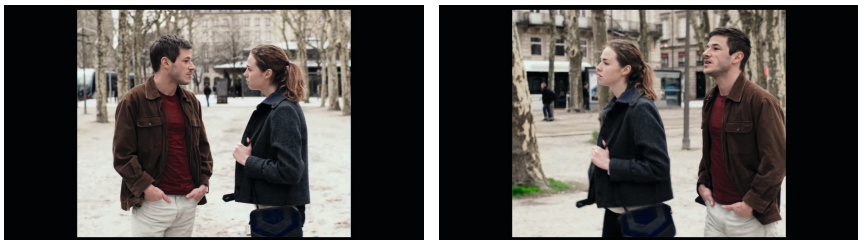
2–3 IL ÉTAIT UNE SECONDE FOIS (2019): The National tricolore according to the status of their relationship (blue jacket and red shirt)

In order to further determine this transnational imagined community evoked by the private love story we need to turn firstly to the character Louise. Born to a rich British father and a French mother, Louise belongs to a transnational European bourgeois elite. Throughout the series she