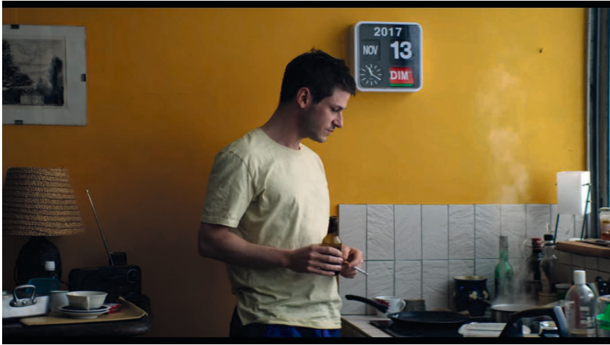
12 IL ÉTAIT UNE SECONDE FOIS (2019): More Yellow Trouble

like the buzzing sound, the insertion of this uncanny prolepsis points thus to the destruction of the wind turbines, which in fact, as mentioned above have never existed due to protests against the energy transition.