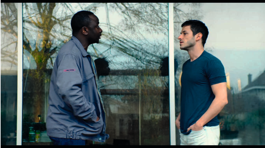
9 Il était une seconde fois (2019): The Postman and the Fourth Square.

illustrate how these narrative devices point towards the political crisis outlined above and render the social contradiction visible.