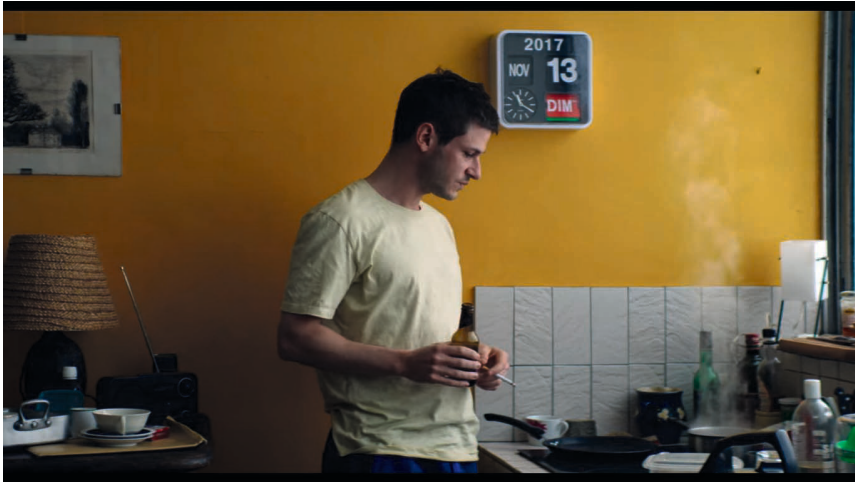
12 IL ÉTAIT UNE SECONDE FOIS (2019): More Yellow Trouble

like the buzzing sound, the insertion of this uncanny prolepsis points thus to the destruction of the wind turbines, which in fact, as mentioned above have never existed due to protests against the energy transition.