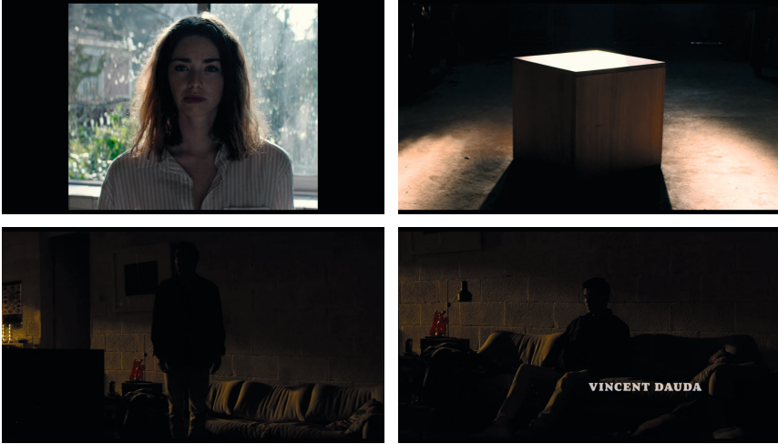
4–7 IL ÉTAIT UNE SECONDE FOIS (2019): Coinciding Shapes: The Film Format 4:3, the Cube, and Kazimir Malevich’s Black Square.

black holes in the universe changing the perception of time and reality which is heard throughout the previous scene. Due to the painting’s resemblance with a black hole, I would argue that this notion of the change of time and perception is hereby linked to the painting. Hence, I would read the Black Square as a fissure or gap in diegetical ‘reality’, which in turn is to be grasped as the cause of the uncanny, fragmented, and elliptical narrative structure of the plot outside of the cube. Accordingly, I would claim that – due to their identity in shape – the cube and the film format 4:3 serve to cover up this fissure in diegetic reality, providing a more linear narration.