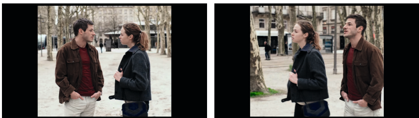
2–3 IL ÉTAIT UNE SECONDE FOIS (2019): The National tricolore according to the status of their relationship (blue jacket and red shirt)

In order to further determine this transnational imagined community evoked by the private love story we need to turn firstly to the character Louise. Born to a rich British father and a French mother, Louise belongs to a transnational European bourgeois elite. Throughout the series she