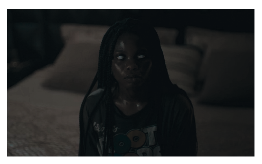
Figure 5: ATLANTIQUE (2019): The girl's gaze and milky eyes as a sign of the spirit.

eyes: There are view axes of view from above-below, the opening of space onto the seemingly horizonless expanse of the sea, we look out of the bar onto the sea (but never from the sea onto the land), there are close-ups of the characters suffering from strange feelings.