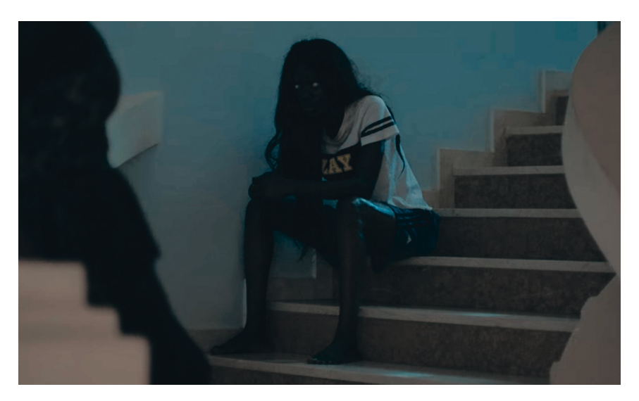
Figure 3: ATLANTIQUE (2019): Her boyfriend's spirit entered the girl's body.

They look at him out of milky, dead eyes (Fig. 3) and speak to him as the returned dead men, claiming the unpaid wages for their deaths at the bottom of the sea. These nocturnal encounters are repeated until one night the boss hands over the money to the girls and digs a grave for each dead young man.