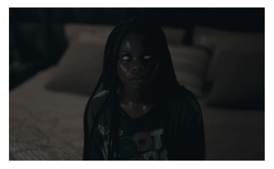
Figure 5: Atlantique (2019): The girl's gaze and milky eyes as a sign of the spirit.

eyes: There are view axes of view from above-below, the opening of space onto the seemingly horizonless expanse of the sea, we look out of the bar onto the sea (but never from the sea onto the land), there are close-ups of the characters suffering from strange feelings.