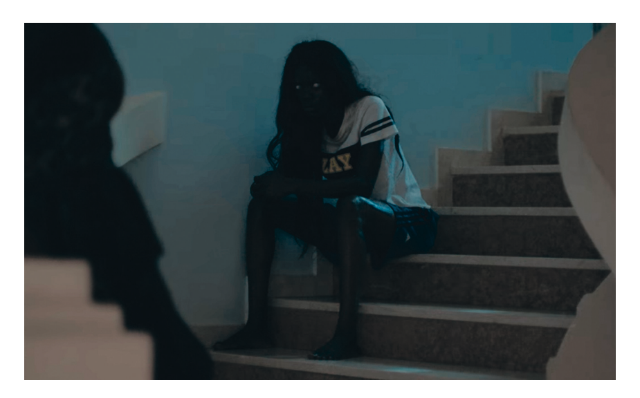
Figure 3: Atlantique (2019): Her boyfriend's spirit entered the girl's body.

They look at him out of milky, dead eyes (Fig. 3) and speak to him as the returned dead men, claiming the unpaid wages for their deaths at the bottom of the sea. These nocturnal encounters are repeated until one night the boss hands over the money to the girls and digs a grave for each dead young man.