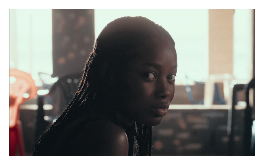
Figure 4: Atlantique (2019): Confident Ada looking directly into the camera.

At the end, Ada speaks confidently, directly looking into the camera and by doing so, she questions, maybe even reverses and decolonizes<sup>7</sup> colonial power relations.