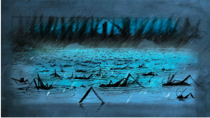
3 LA NUÉE (2020): Locusts on the surface of the lake.

One of the last images shows diving (or dying?) locusts on the surface of the lake.