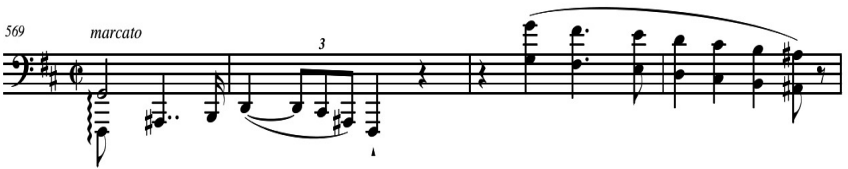
Example 22 – B minor Piano Sonata, dialogue between motivic cell one and two, mm. 569–572

the source of all other ones, is not reducible to its harmonic functions, namely the second-seventh interval. It possesses a descending scale too, which is a functional element. If one does not recognise the relevance of this movement, then its several occurrences during the unfolding of the Sonata were completely inexplicable, as in the case of Example 22 .