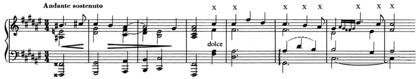
Example 18 – B minor Piano Sonata, development, mm. 331–338

view, the development begins with the Andante sostenuto , with a new theme which immediately appears to be based on the third motivic cell (Example 18; the cell is marked with an “X”).