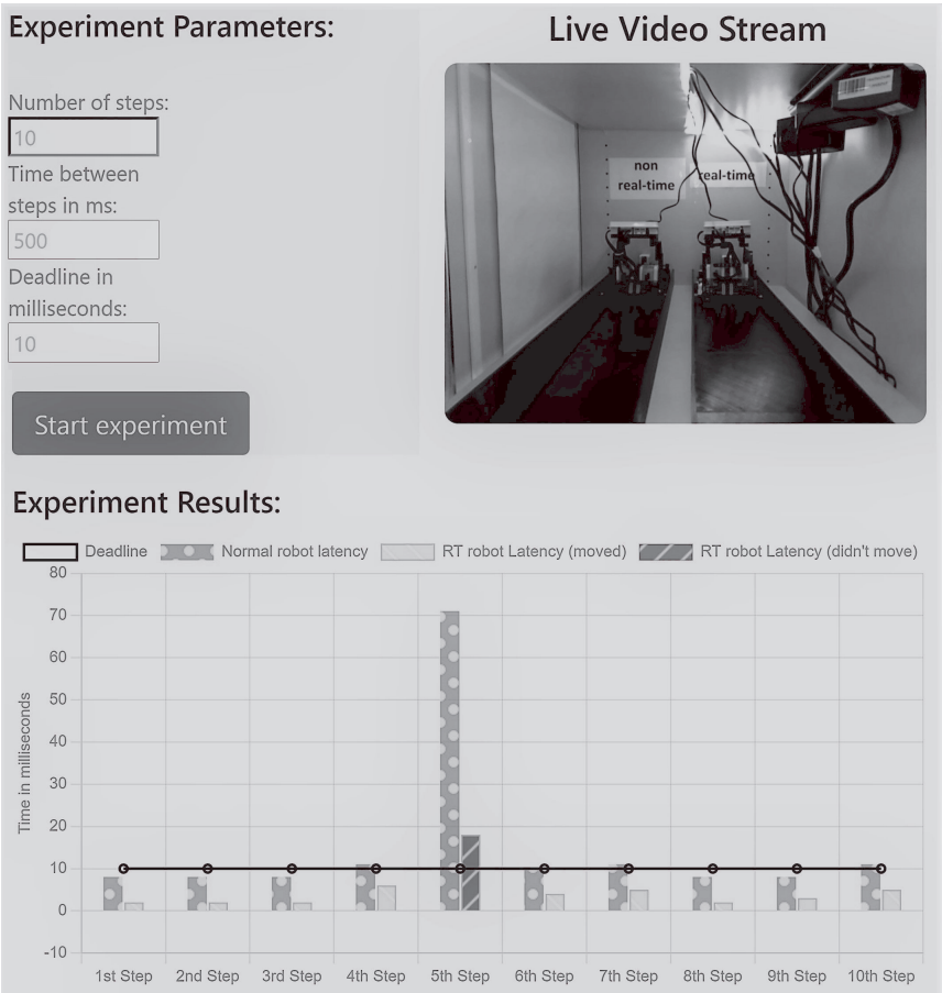
Figure 2. Control Dashboard for the Experiment

dundancy in Time). A shared calendar/scheduler in Moodle allows slots to be reserved to run the experiment. In addition, we isolated the experiments from each other in order to avoid failure propagation across experiments. Currently, we implement the isolation through software virtualization and MQTT settings, such as different topics for different experiments.