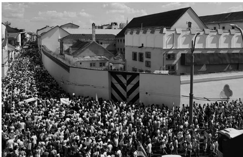
The prison in the city where the author lives, surrounded by thousands of peaceful protesters on 16 August, 2020.