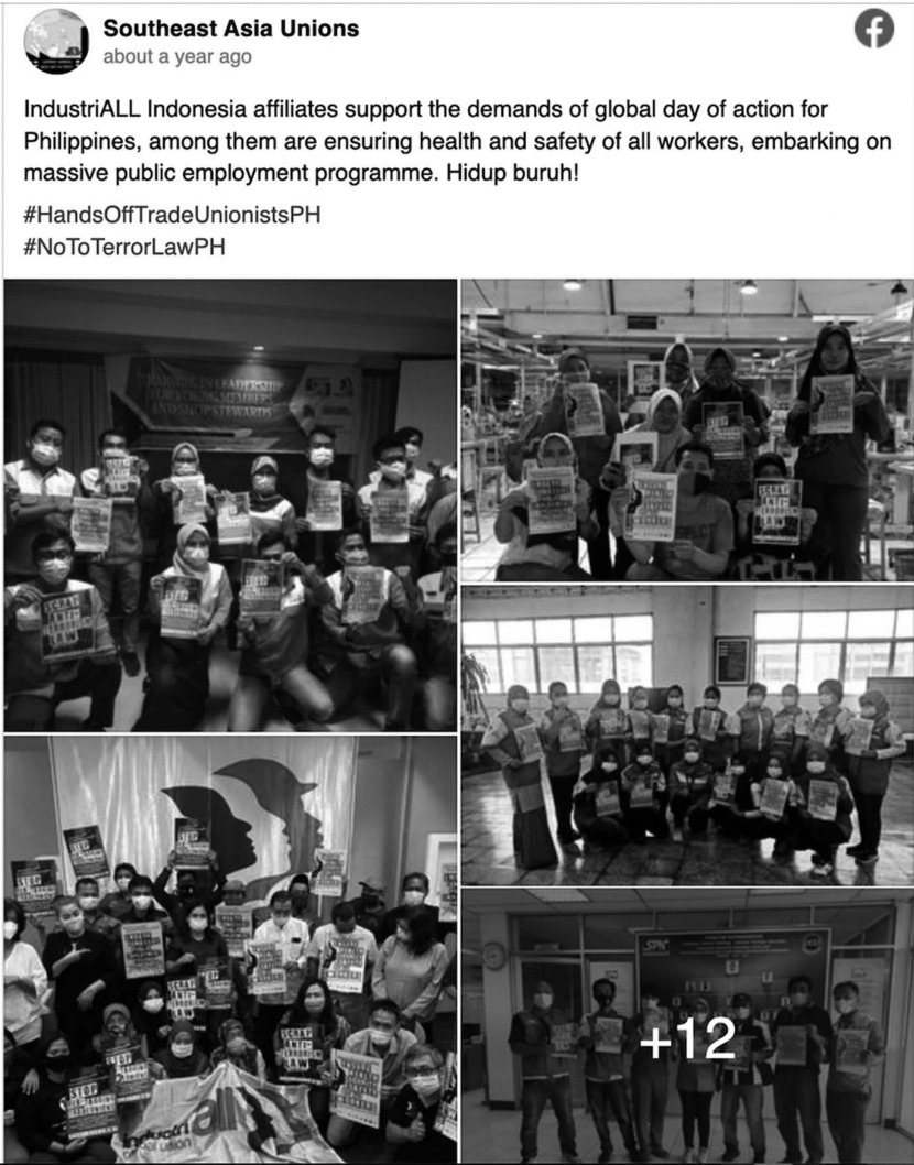
Screenshot of Global Solidarity for Jobs, Rights, Safety, and Accountability in the Philippines.