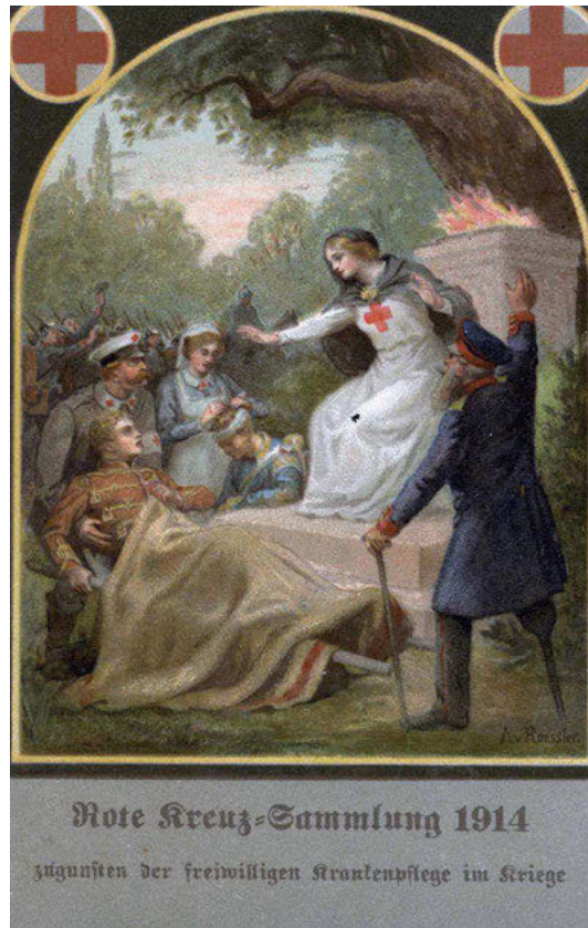
Fig. 3: Reproduced above is a postcard that was in circulation from the beginning of WW I. The postcard could be obtained in return for a small donation, and was intended for the correspondance between soldiers and their families. It is titled: “Red Cross Collection 1914, benefitting nursing volunteers in the war.”

Clothing is key in building up this heroic metaphor, especially the white of the aprons and caps. White became an expression of the purity, cleanliness and virginity of the nurses 85 , a sort of “symbolic representation of the body.” 86 In this case, “white symbolizes purity, cleanliness, and stainlessness, not only in a hygienic sense, but in a moral and sexual sense as well. Drawing from the religious representations of the Madonna Immaculata , the white aprons became a secular symbol of virginal innocence.” 87