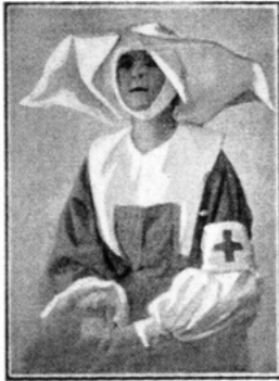
Mlle. Colibri vom Théâtre des Capucines