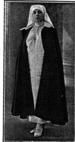
Madame Mars Pearl von der Olympia