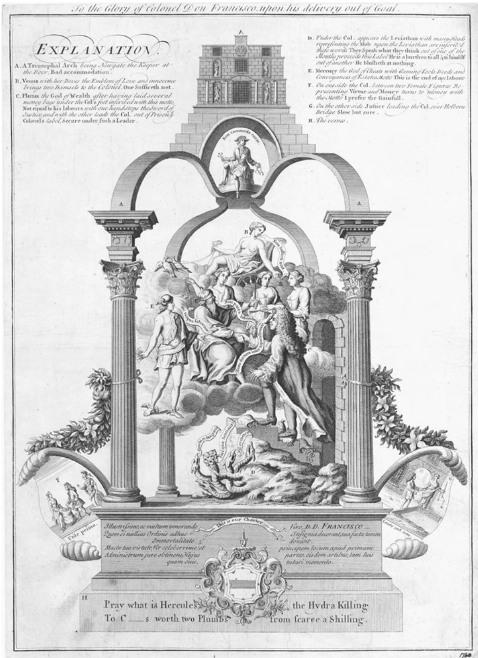
Fig. 6 Anon., To the Glory of Don Francisco, upon his Delivery out of Gaol, May or June 1730, London, British Museum, Inv. No. BM 1841