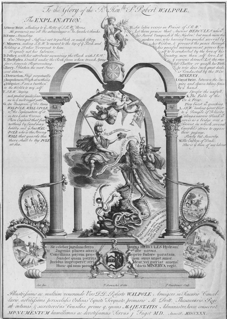
Fig. 5 Dumouchel / Faget / Fourdrinier, The Glory of the Right Honourable Sir Robert Walpole, (May?) 1730, London, British Museum, Inv. No. BM 1842