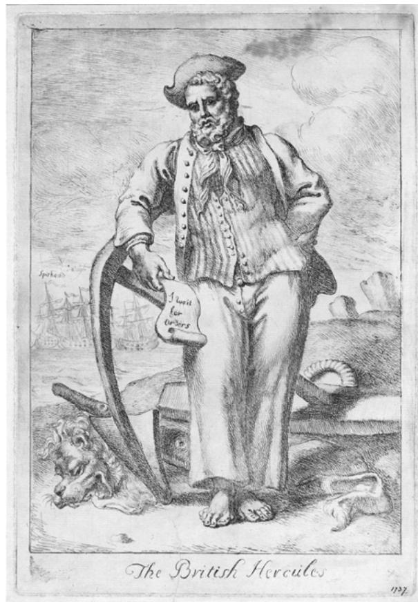
Fig. 4 Anon., The British Hercules , 1737, London, British Museum, Inv. No. BM 2332

This speech by Cassius tests Brutus' willingness to join the assassination plot. Pulteney, the leader of the Whig opposition, replaces Brutus in this quote. Comparing Walpole to Caesar has an ambiguous impact. In theory Caesar is a hero and described as such, for instance in Steele's "Tatler" (e.g. Nr. 81). He is, however, also a cultural code for tyrant which seems to be what is aimed at here, especially in the appeal to the opposition to stop submitting to the dishonour the colossus imposes. 37 The fact-laden description of the Colossus at the very bottom of the print also hints at corruption: The Colossus "cost 300 Talents (a Rhodian Talent is worth 322 Pounds, 18 shillings & 4 Pence in English Money)."