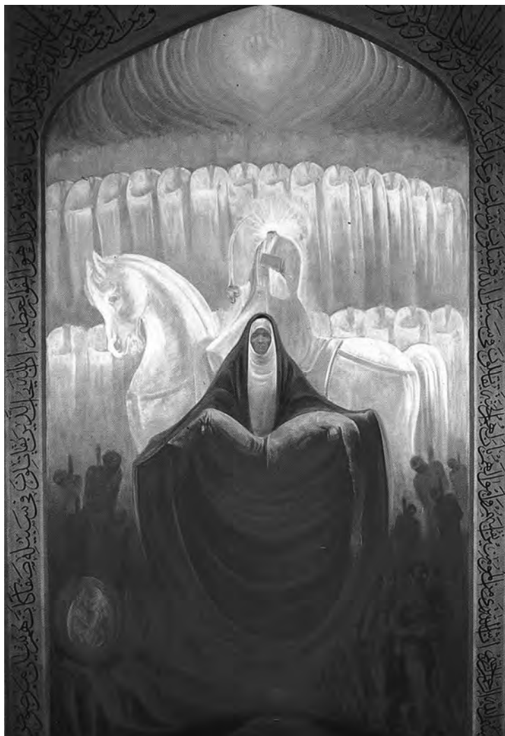
Fig. 4: Kazem Chalipa, Self Sacrifice , c. 1981 (300 × 200 cm)

the centre of the painting and serves to separate two distinct areas, one above her where the colour white prevails and the other below her, bathed in a glowing red atmosphere. To her right, a long line of the dead man's comrades-in arms and co-religionists moves forward with rifles in hand. To her left, a perfectly symmetrical row of red tulips, symbols of martyrs, moves toward the viewer. In the first flower, the semi-transparent petals reveal at their heart a golden light, and a kind of embryo of a future martyr. At the bottom of the painting, we perceive the outline of a grave where another red tulip seems rooted. Its vast corolla forms an altar supporting the arms of the woman who is carrying the body of the martyr as an offering. Above the two symmetrical processions, twisted figures of tor-