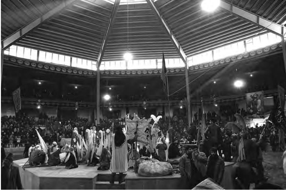
Fig. 1: Hurr 1 Ta'ziyih , Hurr 's army entering takyih (the ta'ziyih space), Gaz, 2010.

Ta'ziyih has been performed in Iran for nearly 400 years as a ritualistic theatre form, rooted in the Islamic Shiite religion; however, it has developed to a level where it needs to be considered as more than a mere religious ritual. At first it was performed only in Iran, followed later in almost all Shiite countries such as Iraq, Lebanon and Bahrain; nonetheless, the most developed theatrical form is still performed in central Iran. It is a performance involving dozens of actors and children as well as featuring both manmade and real animals.