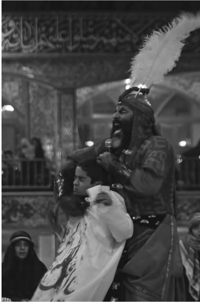
Fig. 4: Ḥusayn ta'ziyih , Shimr killing 'Abdullāh, Khulanjān, 2010.

Apart from any connection to Ḥusayn's history or religious references, child murder fundamentally shakes society. Interestingly, in the performance of the martyrdom of Imam Ḥusayn the murder of his nephew 'Abdullāh – the climax which induces the participants to cry – is shown earlier than the murder of Ḥusayn. Therefore, the martyrdom of Ḥusayn loses its performative significance and necessity, and his martyrdom is disguised and symbolised by releasing pigeons.