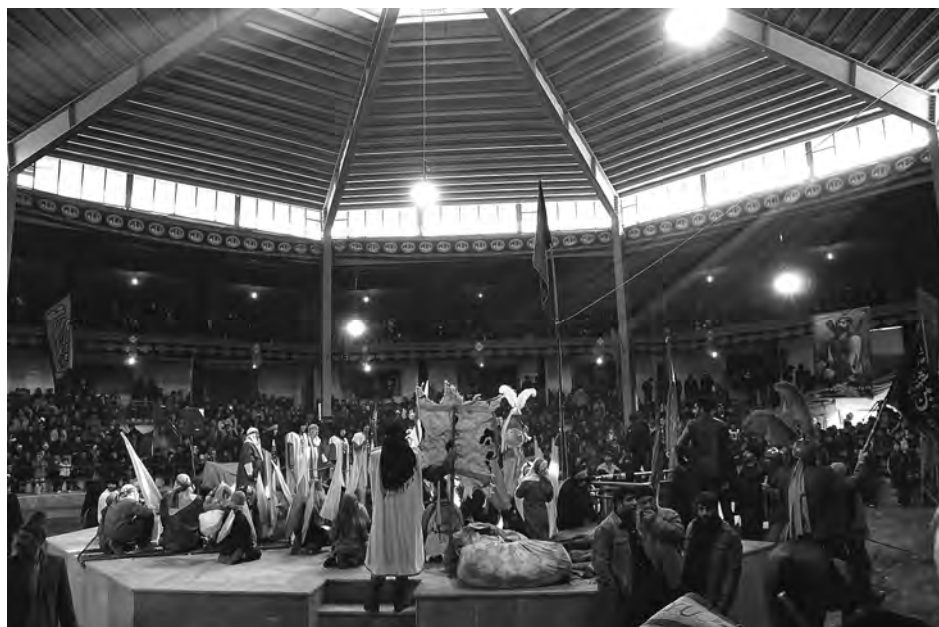
Fig. 1: Hurr 1 Ta'ziyih , Hurr 's army entering takiyih (the ta'ziyih space), Gaz, 2010.

Ta'ziyih has been performed in Iran for nearly 400 years as a ritualistic theatre form, rooted in the Islamic Shiite religion; however, it has developed to a level where it needs to be considered as more than a mere religious ritual. At first it was performed only in Iran, followed later in almost all Shiite countries such as Iraq, Lebanon and Bahrain; nonetheless, the most developed theatrical form is still performed in central Iran. It is a performance involving dozens of actors and children as well as featuring both manmade and real animals.