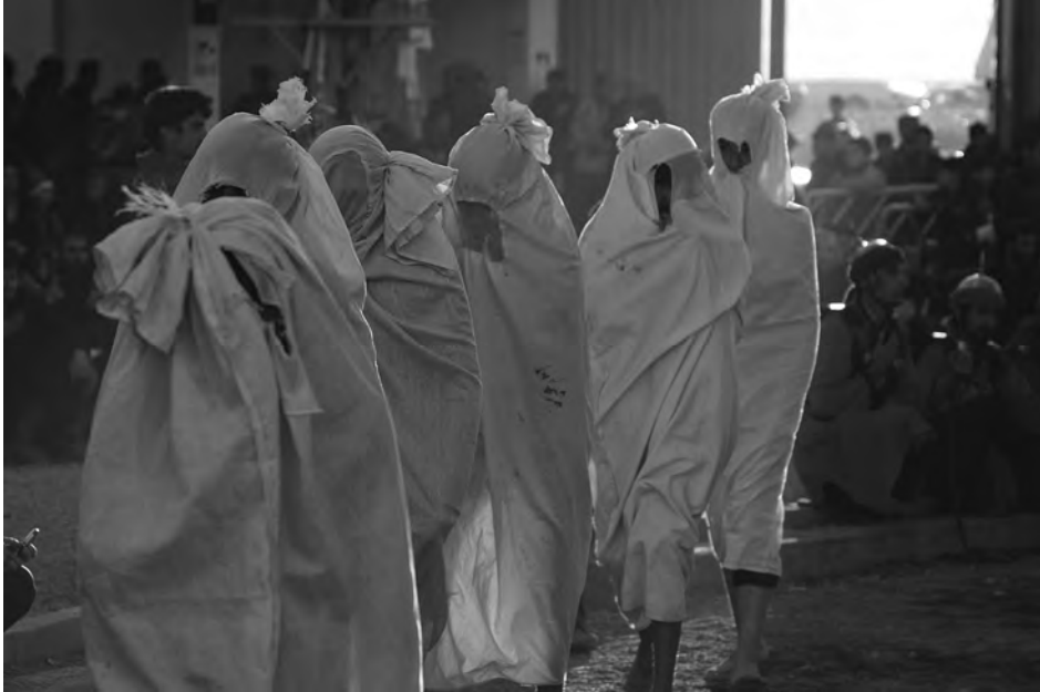
Fig. 3: Ḥusayn Ta'ziyih , The dead and the ghosts rise up to help Ḥusayn, Khulanjān, 2010.

Ḥusayn redefines himself as being a winner and not a loser of war when, after hours of the supernatural army's march, he then refuses their help. Through this position ("He could win if he wanted but he doesn't") his character gravitates even closer to the definition of a martyr of love. He has not been killed by his enemy but he has decided to die. As a result, Ḥusayn's actions and his death in a ta'ziyih challenge the spectator even more.