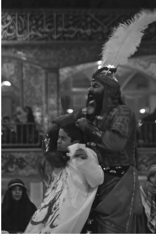
Fig. 4: Ḥusayn ta'ziyih , Shimr killing 'Abdullāh, Khulanjān, 2010.

Apart from any connection to Ḥusayn's history or religious references, child murder fundamentally shakes society. Interestingly, in the performance of the martyrdom of Imam Ḥusayn the murder of his nephew 'Abdullāh – the climax which induces the participants to cry – is shown earlier than the murder of Ḥusayn. Therefore, the martyrdom of Ḥusayn loses its performative significance and necessity, and his martyrdom is disguised and symbolised by releasing pigeons.