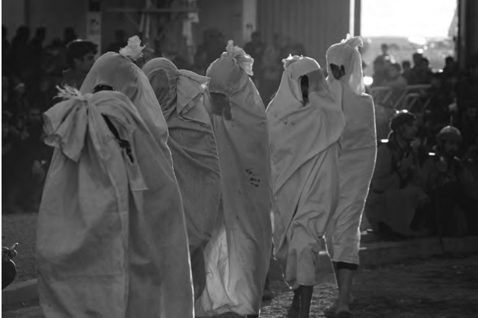
Fig. 3: Ḥusayn Ta'ziyib , The dead and the ghosts rise up to help Ḥusayn, Khulanjān, 2010.

Ḥusayn redefines himself as being a winner and not a loser of war when, after hours of the supernatural army's march, he then refuses their help. Through this position ("He could win if he wanted but he doesn't") his character gravitates even closer to the definition of a martyr of love. He has not been killed by his enemy but he has decided to die. As a result, Ḥusayn's actions and his death in a ta'ziyib challenge the spectator even more.