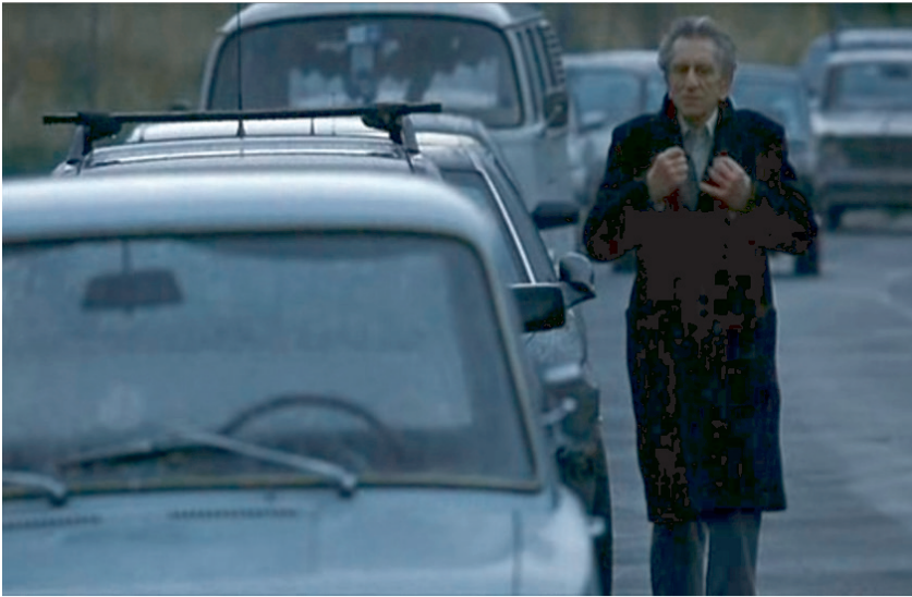
PICTURE 16: Alternative ending: Moro walking away from the «people's prison» in BUONGIORNO, NOTTE (Marco Bellocchio, IT 2003).

Here, the film clearly highlights what Umberto Eco had already noticed, namely that the BR's actions and ideology were functional to the same system they wanted to destroy.