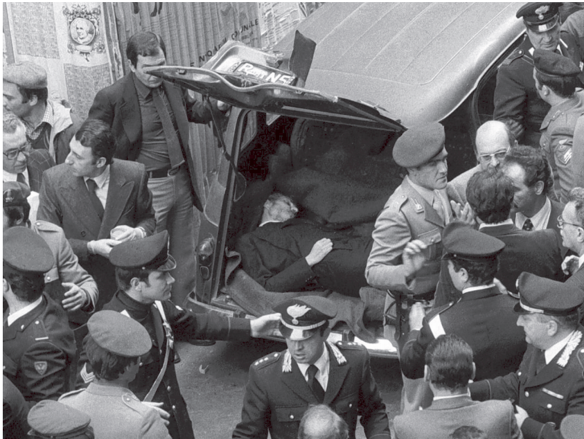
PICTURE 5: The finding of Aldo Moro's body in the trunk of a Renault 4 in via Caetani, Rome, May 9, 1978.