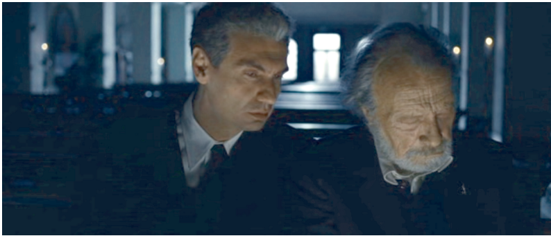
PICTURE 14: Aldo Moro's «confession» in ROMANZO DI UNA STRAGE (Marco Tullio Giordana, IT/F 2012).