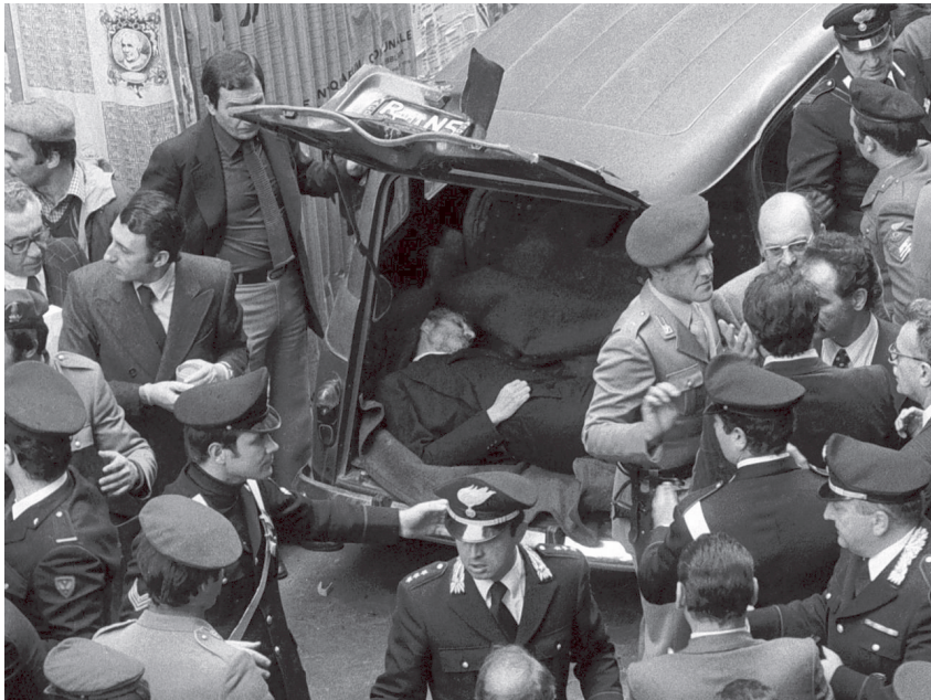
PICTURE 5: The finding of Aldo Moro's body in the trunk of a Renault 4 in via Caetani, Rome, May 9, 1978.