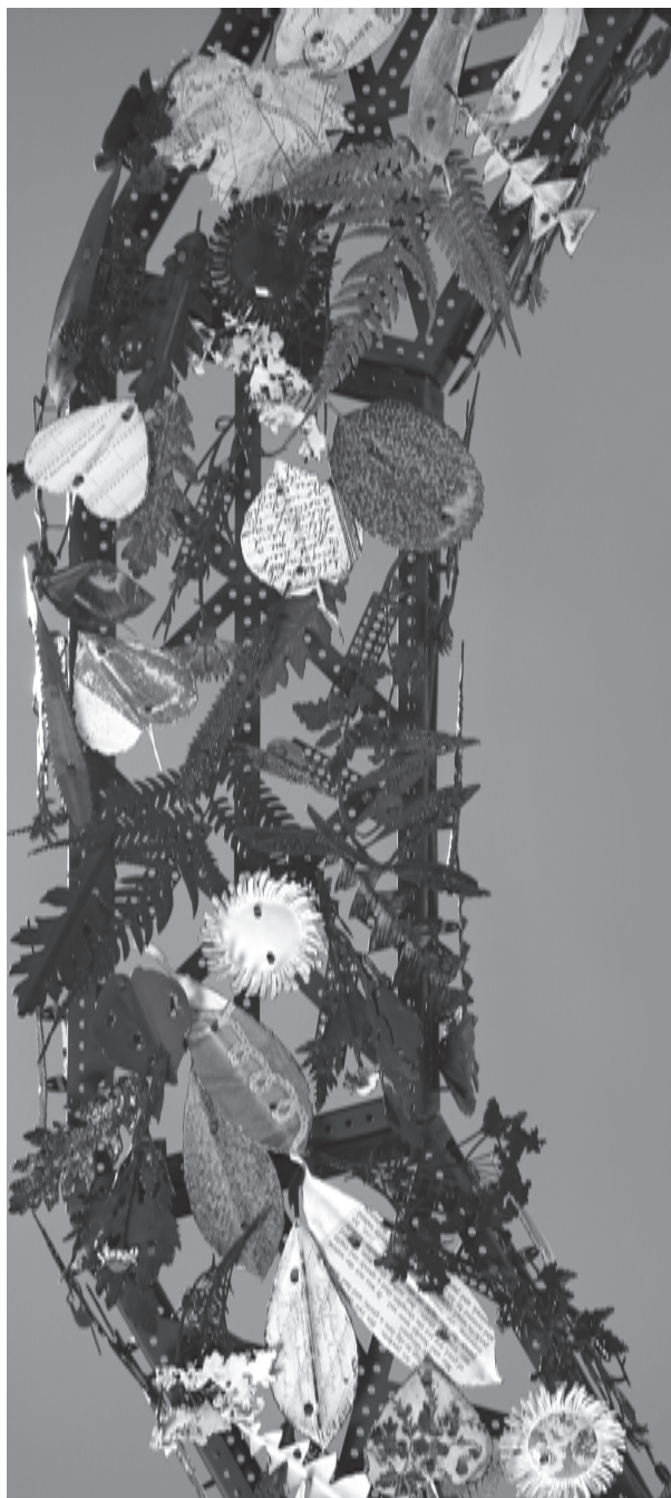
Flowers of War, ( Wreath detail ), 2018.