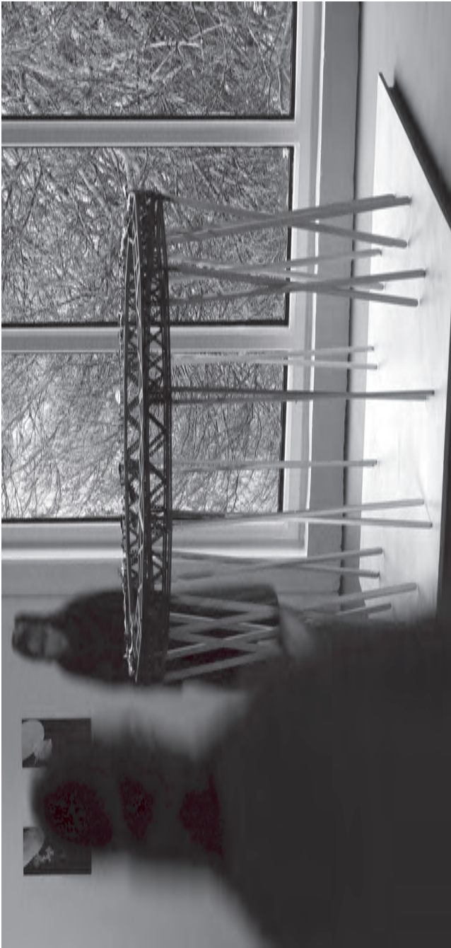
Flowers of War, ( Wreath in progress ), 2017.

© Kirsten Haydon, Neal Haslem and Elizabeth Turrell Installation Canterbury Museum, Christchurch, New Zealand