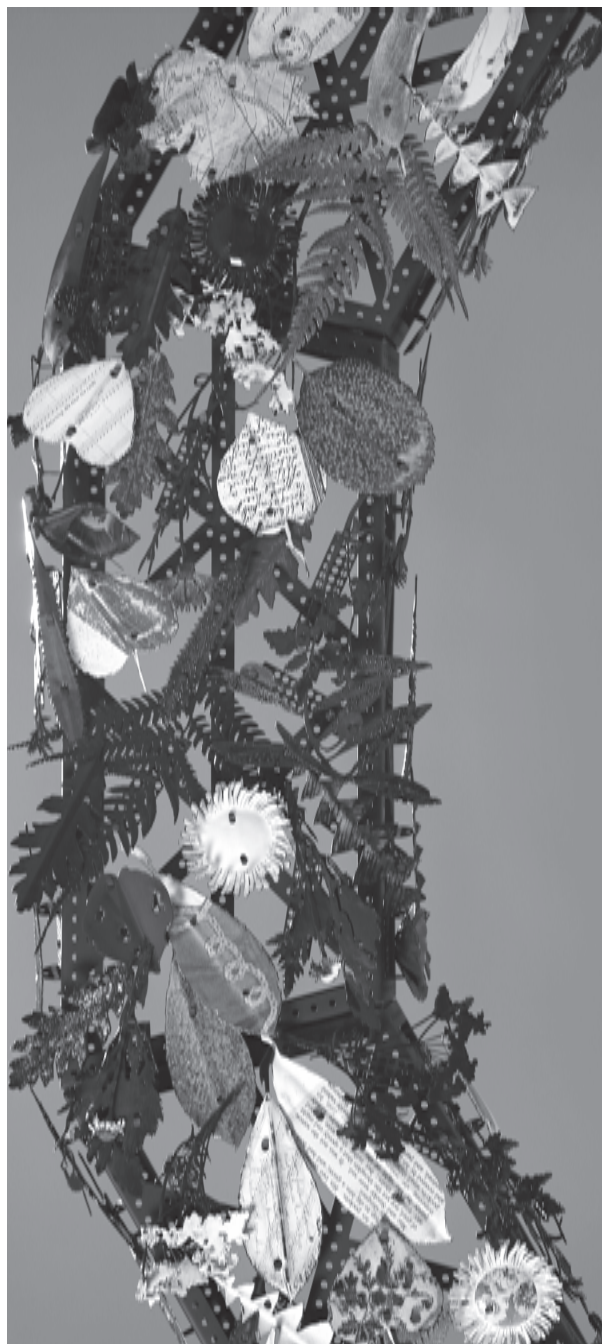
Flowers of War, ( Wreath detail ), 2018.