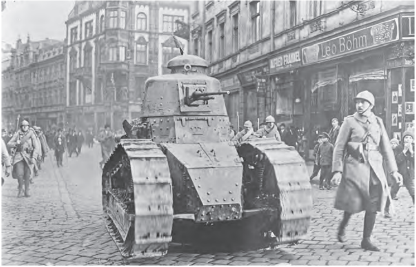
French patrol in Katowice/Kattowitz during the plebiscite of 20 March 1921.

However, calling on Upper Silesians to decide on remaining with Germany or joining Poland did not defuse local tensions. As a matter of fact, both before and after the plebiscite of 20 March 1921, Polish insurgents clashed with German paramilitary forces in order to influence the outcome. Putting the region under international administration for at least a year before holding the plebiscite was supposed to prevent this eventuality, and provide local populations with a ‘cooling off period.’ 10 In practice, the Inter-Allied Commission did little to calm nationalist mobilization. Quite to the contrary: while the French, whose contingent was by far the biggest, more or less openly backed the Polish insurgents, the British and Italian detachments tolerated the armed activities of right-wing German Freikorps . 11 The results of the plebiscite showed another limitation of the plan