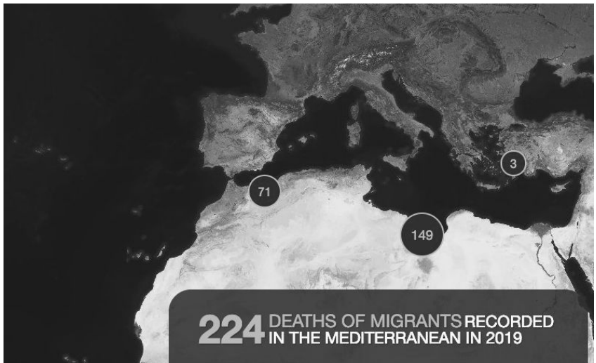
Source: IOM, 'Deaths by Route' (28 February 2019) https://missingmigrants.iom.int/region/mediterranean?

In particular, the impetus for the realisation of the HCs came following the death of at least 800 migrants of multiple nationalities (including Syri-