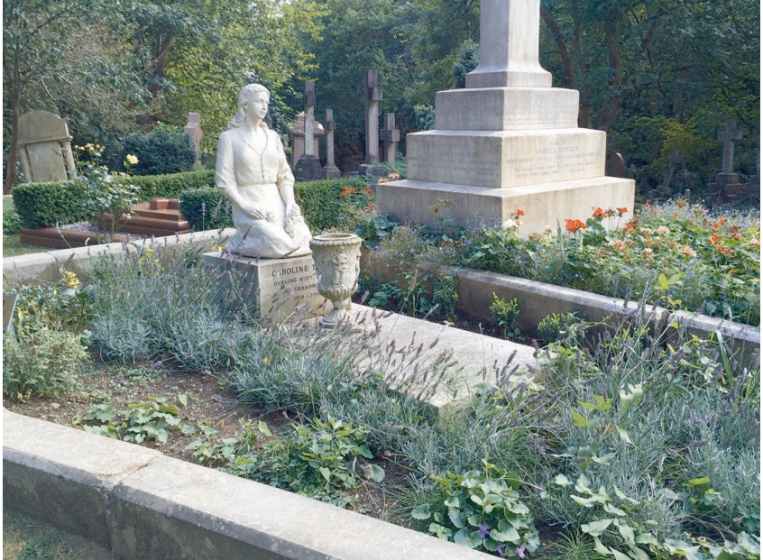
Fig. 4: The Grave of Caroline Tucker (1910–1994) in Highgate's East Cemetery.

configuration, visible and tangible things, but also «such unbodylike entities as thoughts and memories.» 28 The individual grave does so through its position, through the tombstone with a name and dates, through its desolation or trimness, through an inscription or the visual representation of powerful symbols such as a rose, a lily or ivy, but also through the planting surrounding it, through a bunch of flowers, a candle or a personal object left behind.