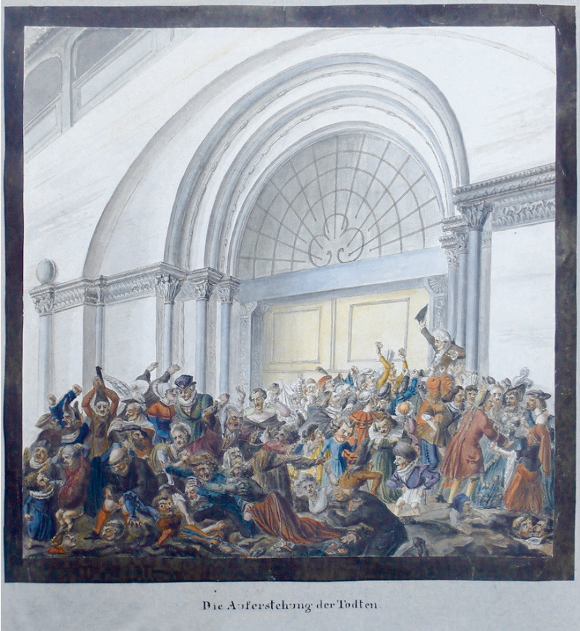
Die Auferstehung der Todten.