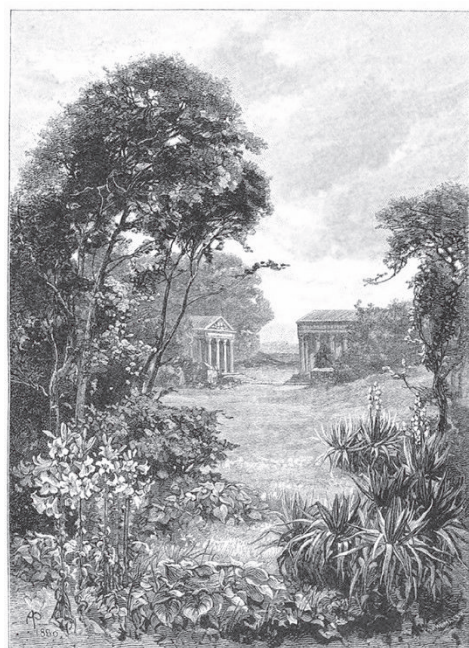
A CEMETERY OF THE FUTURE.