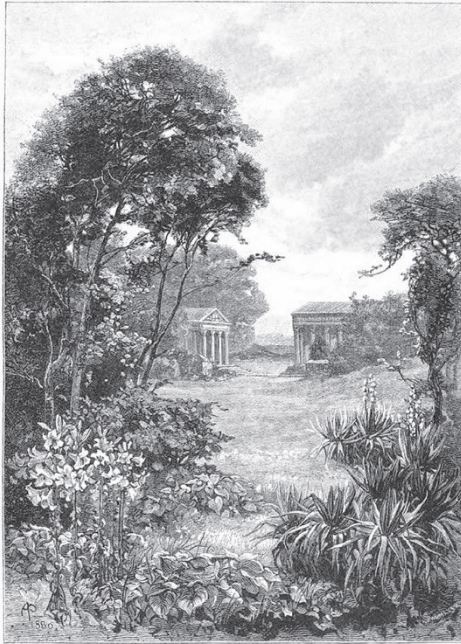
A CEMETERY OF THE FUTURE. FRONTISPIECE.