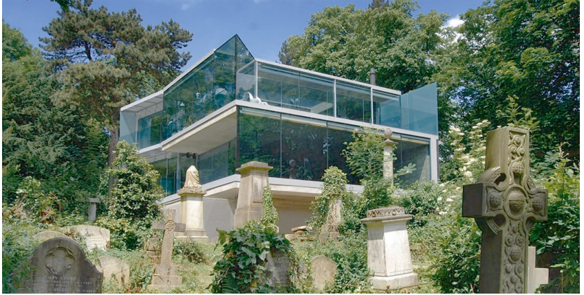
Fig. 5: Eldridge London Architects + Designers, House in Highgate Cemetery , Swains Lane.

ment in many ways, not least through the name of the mansion, «House in Highgate Cemetery.» 41