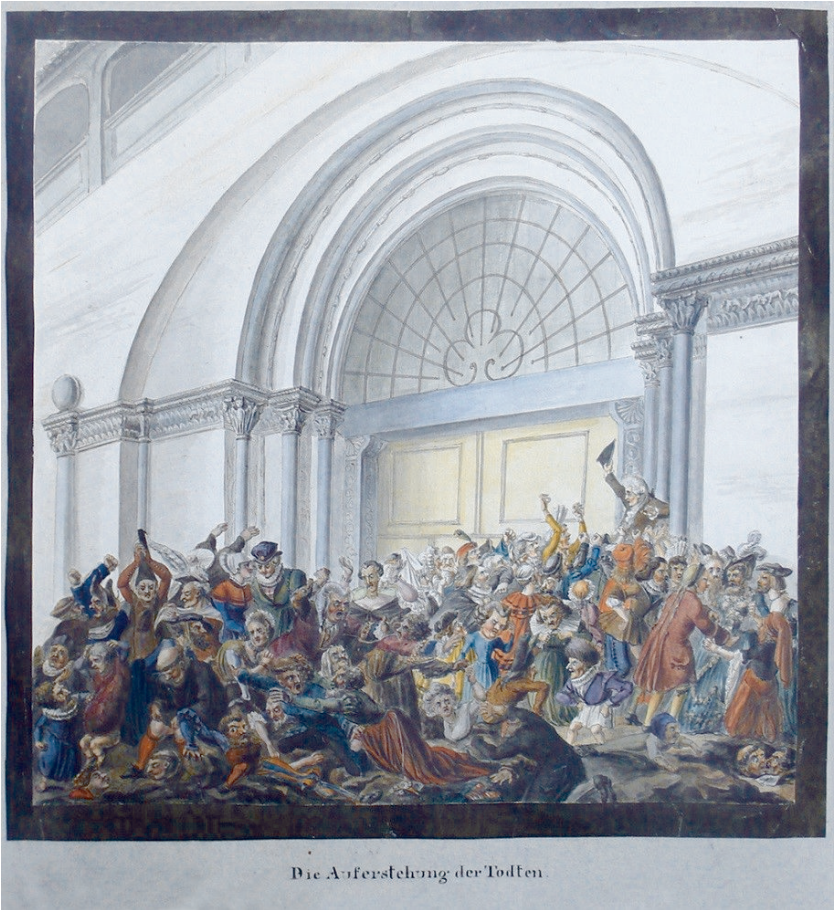
Fig. 1: Johann Martin Usteri, The Resurrection of the Dead , around 1796, pen and ink and watercolour on paper, mounted on paper, image size: 35 x 35,5 cm; paper size: 38,5 x 38,8 cm, Kunsthaus Zürich, Dept. Prints and Drawings, Bequest by Magdalena Oeri-Hess, Inv.-No.: Z.A.B. 2609.14.