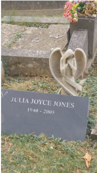
Fig. 8: A small white marble angel stands behind a black marble memorial plaque. Highgate East Cemetery (Image: Natalie Fritz 2016).

tual circumstances, the actual context. 40 If we have a closer look at an angel figure on a more recent grave in the Eastern part of the cemetery we will understand how Kierkegaard's thesis of repeating can also function on an aesthetic level: by adapting a specific iconography to a new context (fig. 8) the artist transfers the past – as a repetition of a specific visual strategy in combination with individual and collective commemoration processes – into the present and in this sense «makes eternity visible».