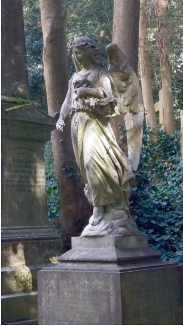
Fig. 11: This angel is scattering a forget-me-not, an explicit cue to the visitor. Highgate East Cemetery.