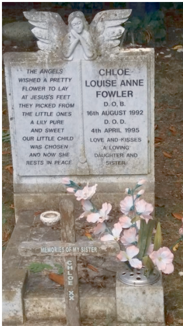
Fig. 1: The melancholic angel: The tomb of Chloe Louise Anne Fowler, a three year old girl, in the Eastern part of Highgate Cemetery, London (Image: Natalie Fritz 2016).

«The Angels wished a pretty flower to lay at Jesus's feet/they picked from the little ones a lily pure and sweet/our little child was chosen, and now she rests in peace.» This bittersweet poem is engraved on a tombstone erected on a grave for a three year old girl (fig. 1).