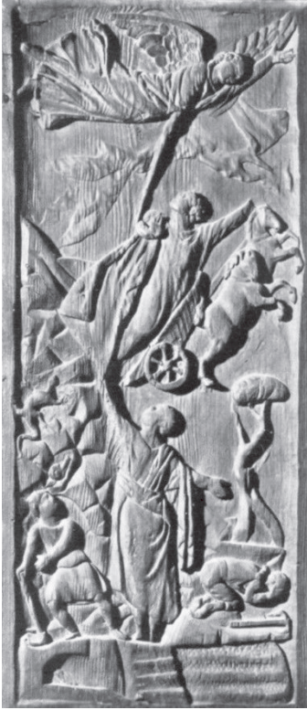
Fig. 2: Rome, S. Sabina, relief on wooden door, right side, about 430 AD: Ascension of Elijah: Elisha grasps the coat of the prophet (© University of Bologna/Fondazione Federico Zeri - Fototeca Zeri, Università di Bologna, inv. 2953).

Roman Genii. Based on the idea that celestial beings need to have wings, representations from the early 5 th century onwards tend to depict winged, male angels. Until the Middle Ages this way of depicting angels remains the standard artistic convention (fig. 2).