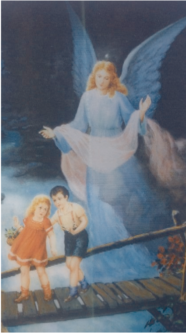
Fig. 3: Kitsch: A postcard with a guardian angel watching over two small children crossing a wild river, EGIM srl Milano, Italy (Image: Natalie Fritz).

martial and potentially bisexual males they had been.» 17 Therefore these female angels are often used to illustrate moments of the strongest emotions, greatest joy and most intense pain. We see these angels in various portraits of the deposition from the cross or supporting the dead Christ (so called angel pietà ). 18 But they also praise, often gathered in groups, the expectant mother or sing for the new born child. As so called «soul bearers» angels appear on Italian tombstones and mourning monuments in the 13 th century. 19 As – in this sense – guardian angels, they watch over humans (Mt. 18:10) and assist them actively to avoid trespassing the law and live a good life. In the 14 th century they also become guides or escorts of deceased persons – a development of the soul bearer role that transforms the function