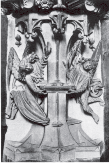
Fig. 5: Gernsbach (Baden), last third of 15th century: Angel at the house of sacraments; the angels are feathered.

cupatory potential, and generate the utopian hope of recovering the unities lost in the process of rationalist fragmentation and reconstruction of the subject under capitalism.» 22 Gregg Garrett adds: «Iconographically influenced by the art of the Middle Ages and the Renaissance they [the angels] embodied now Victorian piety in a specific way: Burne-Jones represented them as «dignified, stately, powerful, useful.» 23 Garrett explains that Burne-Jones' particular way of representing angels in various situations and functions made them a popular motif for a variety of different media and times: «And impressively the artist showed these beings in their various functions as guardian angels, archangels and so on. Burne-Jones's angels are not limited to the Victorian era but had an impact on the representation of these beings until the times after World War I.» 24