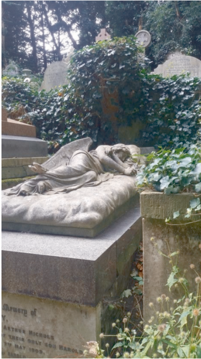
Fig. 6: The recumbent angel on the bed. Highgate East Cemetery.