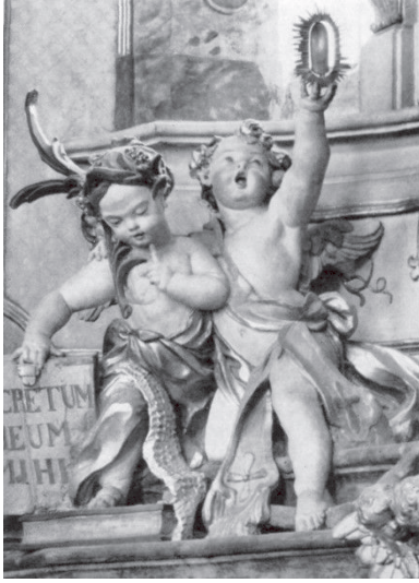
Fig. 4: Klosterkirche Osterhofen: Putto (Cherub) with attributes of the Saint John of Nepomuk (RDK V, 473, Abb. 86. E. Q. Asam, 1732, Photo: O. Poss, Regensburg, AS 4824).

of the guardian angel for the living into a continuing service that guides the deceased into the transcendent sphere of a specific afterlife. 20