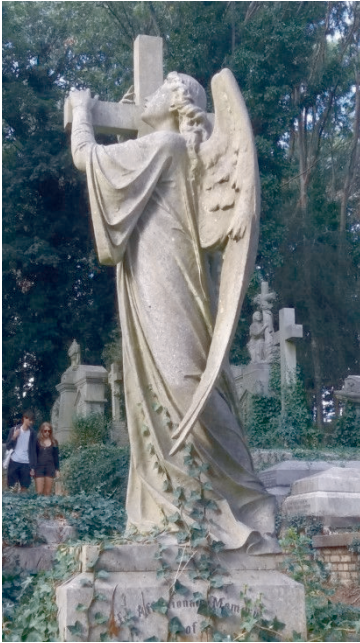
Fig. 9: There are several angel figures at Highgate Cemetery that lean on a cross, head lifted up towards heaven as if they would promise a better life beyond the human sphere. Highgate East Cemetery.

All angel representations work as an archive of a specific belief, a specific orientation that still has a certain impact on our present life, but some of them refer to explicit concepts which may not be known anymore. As an example let us look at an «angel holding a cross» representation we find on several tombs in Highgate Cemetery.