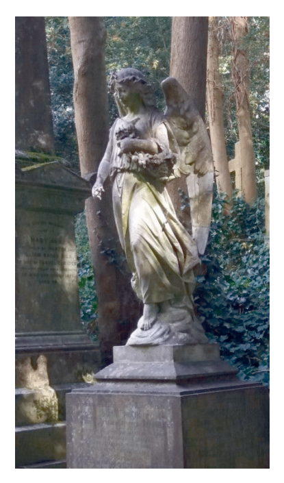
Fig. 11: This angel is scattering a forget-me-not, an explicit cue to the visitor. Highgate East Cemetery.