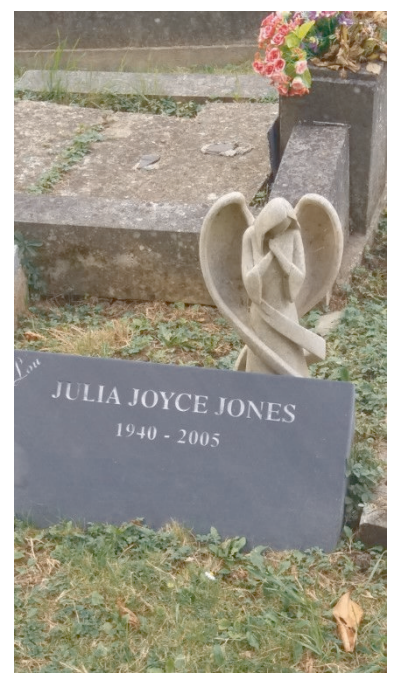
Fig. 8: A small white marble angel stands behind a black marble memorial plaque. Highgate East Cemetery.

tual circumstances, the actual context.<sup>40</sup> If we have a closer look at an angel figure on a more recent grave in the Eastern part of the cemetery we will understand how Kierkegaard's thesis of repeating can also function on an aesthetic level: by adapting a specific iconography to a new context (fig. 8) the artist transfers the past – as a repetition of a specific visual strategy in combination with individual and collective commemoration processes – into the present and in this sense makes eternity visible.