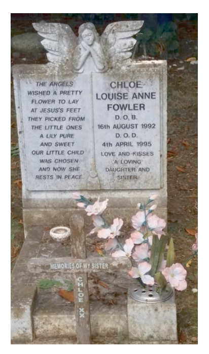
Fig. 1: The melancholic angel: The tomb of Chloe Louise Anne Fowler, a three year old girl, in the Eastern part of Highgate Cemetery, London (Image: Natalie Fritz 2016).

«The Angels wished a pretty flower to lay at Jesus's feet/they picked from the little ones a lily pure and sweet/our little child was chosen, and now she rests in peace.» This bittersweet poem is engraved on a tombstone erected on a grave for a three year old girl (fig. 1).