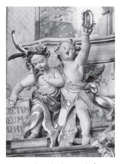
Fig. 4: Klosterkirche Osterhofen: Putto (Cherub) with attributes of the Saint John of Nepomuk (RDK V, 473, Abb. 86. E. Q. Asam, 1732, Photo: O. Poss, Regensburg, AS 4824).

of the guardian angel for the living into a continuing service that guides the deceased into the transcendent sphere of a specific afterlife.<sup>20</sup>