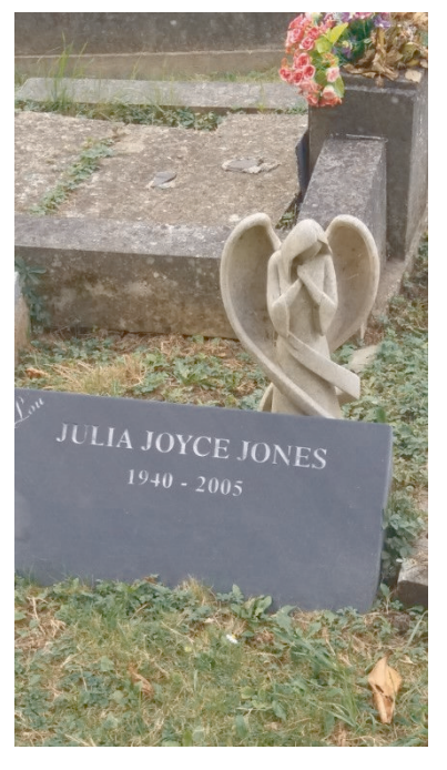
Fig. 8: A small white marble angel stands behind a black marble memorial plaque. Highgate East Cemetery.

tual circumstances, the actual context.<sup>40</sup> If we have a closer look at an angel figure on a more recent grave in the Eastern part of the cemetery we will understand how Kierkegaard's thesis of repeating can also function on an aesthetic level: by adapting a specific iconography to a new context (fig. 8) the artist transfers the past – as a repetition of a specific visual strategy in combination with individual and collective commemoration processes – into the present and in this sense makes eternity visible.