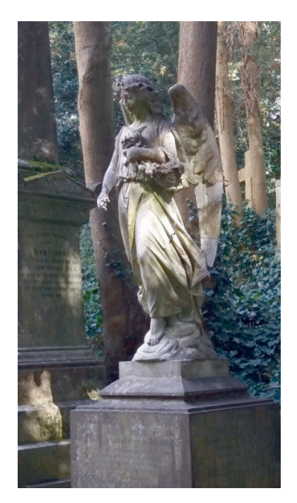
Fig. 11: This angel is scattering a forget-me-not, an explicit cue to the visitor. Highgate East Cemetery.