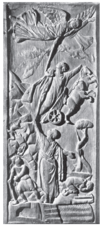
Fig. 2: Rome, S. Sabina, relief on wooden door, right side, about 430 AD: Ascension of Elijah: Elisha grasps the coat of the prophet (© University of Bologna/Fondazione Federico Zeri - Fototeca Zeri, Università di Bologna, inv. 2953).

Roman Genii. Based on the idea that celestial beings need to have wings, representations from the early 5<sup>th</sup> century onwards tend to depict winged, male angels. Until the Middle Ages this way of depicting angels remains the standard artistic convention (fig. 2).