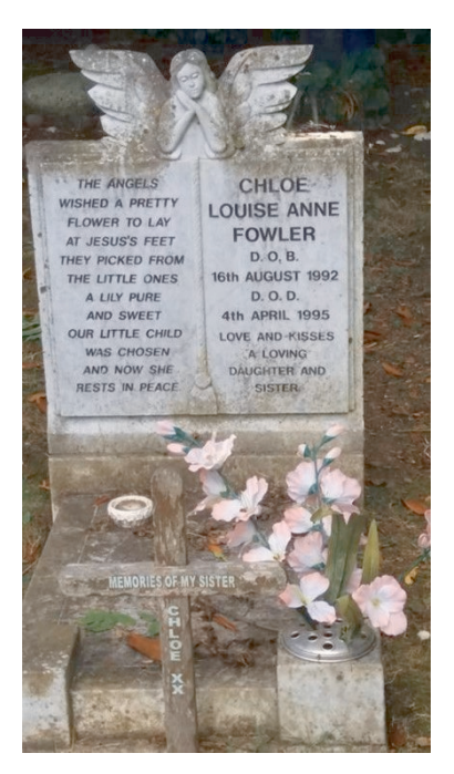
Fig. 1: The melancholic angel: The tomb of Chloe Louise Anne Fowler, a three year old girl, in the Eastern part of Highgate Cemetery, London.

«The Angels wished a pretty flower to lay at Jesus's feet/they picked from the little ones a lily pure and sweet/our little child was chosen, and now she rests in peace.» This bittersweet poem is engraved on a tombstone erected on a grave for a three year old girl (fig. 1).