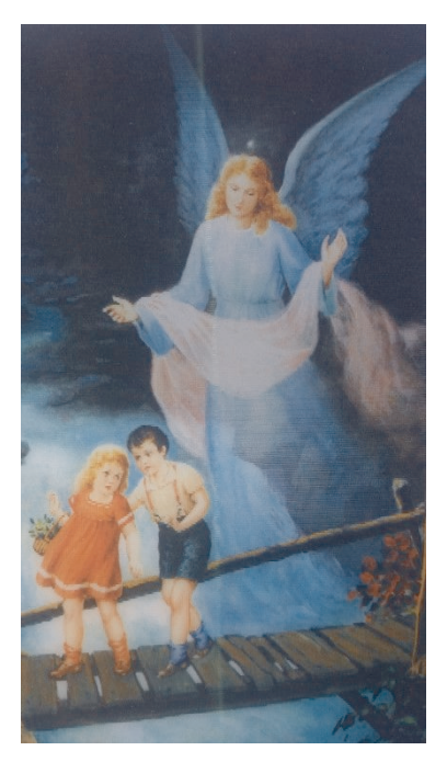
Fig. 3: Kitsch: A postcard with a guardian angel watching over two small children crossing a wild river, EGIM srl Milano, Italy.

martial and potentially bisexual males they had been.»<sup>17</sup> Therefore these female angels are often used to illustrate moments of the strongest emotions, greatest joy and most intense pain. We see these angels in various portraits of the deposition from the cross or supporting the dead Christ (so called angel pietà ).<sup>18</sup> But they also praise, often gathered in groups, the expectant mother or sing for the new born child. As so called soul bearers angels appear on Italian tombstones and mourning monuments in the 13<sup>th</sup> century.<sup>19</sup> As – in this sense – guardian angels, they watch over humans (Mt. 18:10) and assist them actively to avoid trespassing the law and live a good life. In the 14<sup>th</sup> century they also become guides or escorts of deceased persons – a development of the soul bearer role that transforms the function