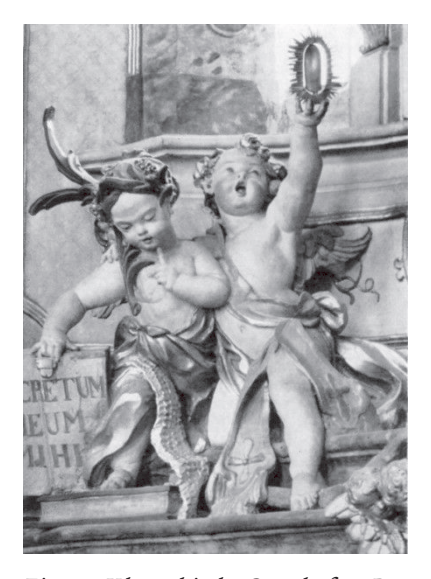
Fig. 4: Klosterkirche Osterhofen: Putto (Cherub) with attributes of the Saint John of Nepomuk (RDK V, 473, Abb. 86. E. Q. Asam, 1732, Photo: O. Poss, Regensburg, AS 4824).

of the guardian angel for the living into a continuing service that guides the deceased into the transcendent sphere of a specific afterlife.<sup>20</sup>