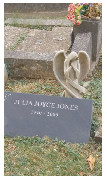
Fig. 8: A small white marble angel stands behind a black marble memorial plaque. Highgate East Cemetery (Image: Natalie Fritz 2016).

tual circumstances, the actual context.<sup>40</sup> If we have a closer look at an angel figure on a more recent grave in the Eastern part of the cemetery we will understand how Kierkegaard's thesis of repeating can also function on an aesthetic level: by adapting a specific iconography to a new context (fig. 8) the artist transfers the past – as a repetition of a specific visual strategy in combination with individual and collective commemoration processes – into the present and in this sense makes eternity visible.