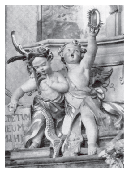
Fig. 4: Klosterkirche Osterhofen: Putto (Cherub) with attributes of the Saint John of Nepomuk (RDK V, 473, Abb. 86. E. Q. Asam, 1732, Photo: O. Poss, Regensburg, AS 4824).

of the guardian angel for the living into a continuing service that guides the deceased into the transcendent sphere of a specific afterlife.<sup>20</sup>