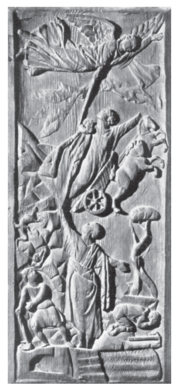
Fig. 2: Rome, S. Sabina, relief on wooden door, right side, about 430 AD: Ascension of Elijah: Elisha grasps the coat of the prophet (© University of Bologna/Fondazione Federico Zeri - Fototeca Zeri, Università di Bologna, inv. 2953).

Roman Genii. Based on the idea that celestial beings need to have wings, representations from the early 5<sup>th</sup> century onwards tend to depict winged, male angels. Until the Middle Ages this way of depicting angels remains the standard artistic convention (fig. 2).