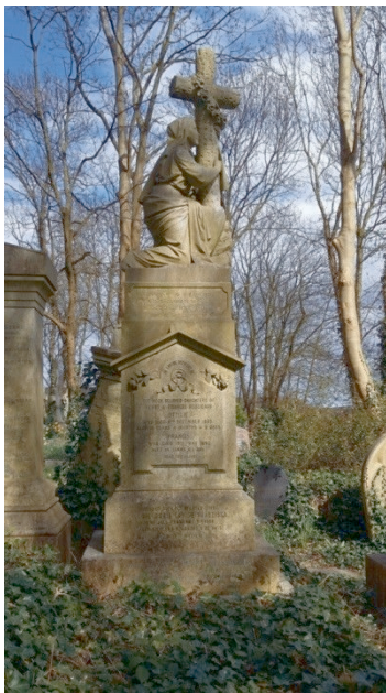
Fig. 2: Grave Monument of Otilie and Frances Reissmann.

The final section of this paper focuses upon the grave of two young sisters Otilie and Frances Reissmann, in Highgate East cemetery, attentive to the role that the choice of gravestone plays in the memorialized performance of their respectable Victorian lives and deaths. The gravestone is of monumental height, comprised of three interconnected levels (figs. 2 and 3).