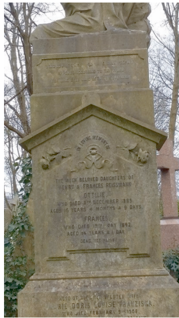
Fig 3: Detail of the epitaphs to the deceased sisters.