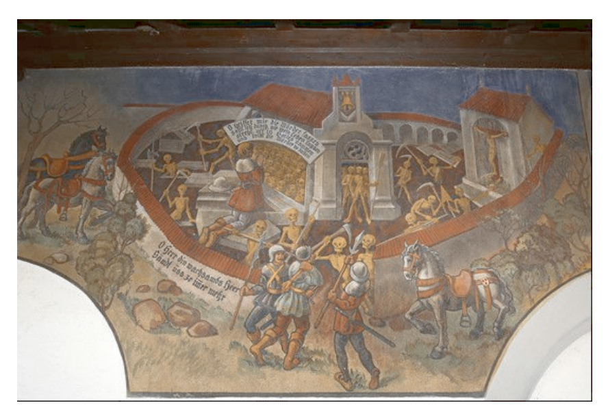
Fig. 1: The grateful dead helping a praying knight against bandits. Wall-painting on the ossuary of Baar (CH), 16<sup>th</sup> century, painted over 1933 (Image: Yves Müller 2017).

the resurrected as skeletons and cadavers, not in the sense in which we imagine ghosts today.