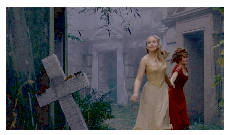
Fig. 3: Alice Hargood (played by Linda Hayden) leads Lucy Paxton (played by Isla Blair) into Highgate Cemetery (Film still: Taste the Blood of Dracula, 00:46:26).

I therefore argue that in this case we find an interrelation between the materiality of a cemetery (in this example the abandoned state of the place) and specific imaginations. These imaginations are initiated by the materiality and resulted in sociocultural practices (like vampire-hunts). These practices are linked to religious ideas of how to fight against (imagined) evil forces. So, again, we find a close interrelation between the materiality of a place, specific imaginations, and (socio-religious) practices.