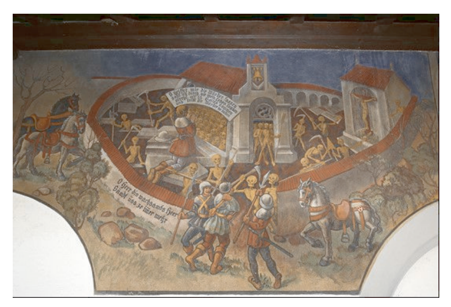
Fig. 1: The grateful dead helping a praying knight against bandits. Wall-painting on the ossuary of Baar (CH), 16<sup>th</sup> century, painted over 1933 (Image: Yves Müller 2017).

the resurrected as skeletons and cadavers, not in the sense in which we imagine ghosts today.