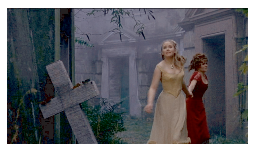
Fig. 3: Alice Hargood (played by Linda Hayden) leads Lucy Paxton (played by Isla Blair) into Highgate Cemetery (Film still: Taste the Blood of Dracula, 00:46:26).

I therefore argue that in this case we find an interrelation between the materiality of a cemetery (in this example the abandoned state of the place) and specific imaginations. These imaginations are initiated by the materiality and resulted in sociocultural practices (like vampire-hunts). These practices are linked to religious ideas of how to fight against (imagined) evil forces. So, again, we find a close interrelation between the materiality of a place, specific imaginations, and (socio-religious) practices.