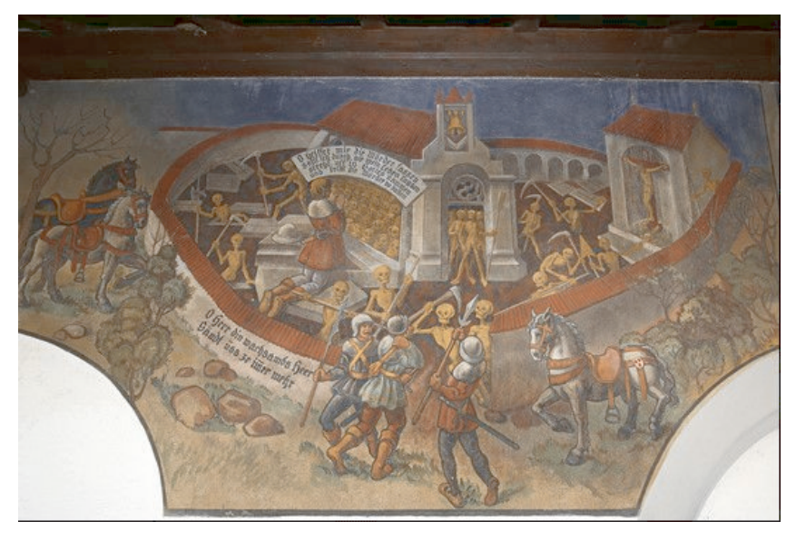
Fig. 1: The grateful dead helping a praying knight against bandits. Wall-painting on the ossuary of Baar (CH), 16th century, painted over 1933.

the resurrected as skeletons and cadavers, not in the sense in which we imagine ghosts today.