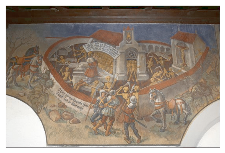
Fig. 1: The grateful dead helping a praying knight against bandits. Wall-painting on the ossuary of Baar (CH), 16th century, painted over 1933 (Image: Yves Müller 2017).

the resurrected as skeletons and cadavers, not in the sense in which we imagine ghosts today.