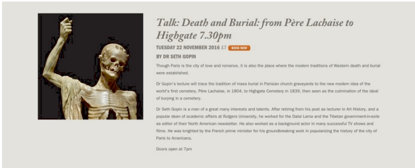
Fig. 5: The memento mori figure is not immediately connected to the topic but is at least a catchy subject.