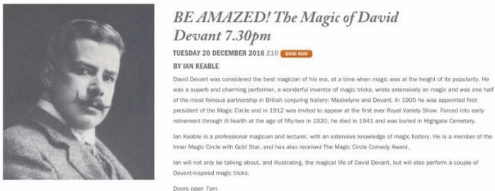
Fig. 6: The Magician David Devant and his performances are at the centre of this talk.

The final announcement of a talk in the 2016 series revitalises the life of a famous early 20 th century magician, regarded as the 'best magician in his day', David Devant who is buried at Highgate cemetery (fig. 6).