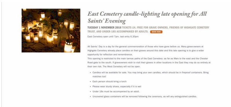
Fig. 7: Lighted candles are put on a grave to remember the deceased.

Another event refers to an explicit Christian practice and takes place at East Highgate. All Saints' Evening is celebrated on November 1 (fig. 7). Grave owners, the Friends of Highgate Cemetery trust and children under 18 years have free access. Everybody else needs to pay £4.