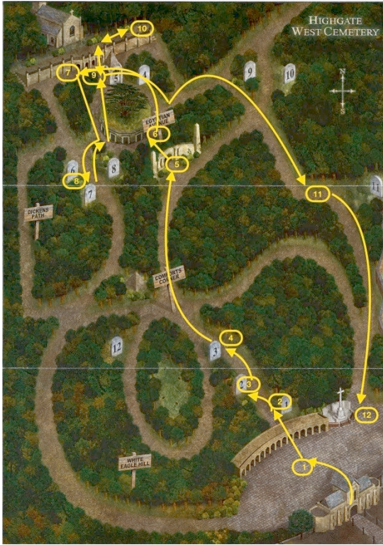
Fig. 8: The map is pictured on the back of the flyer that is distributed at the entrance to the cemetery.

The applied method of gathering data in the field and later interpreting it evaluates how the tour shapes the reception of the cemetery. The data is analysed by a combination of two approaches namely sociological hermeneutics of knowledge and grounded theory. 26 The analysing process has been adapted to the collected data of the field notes and is divided into three steps. 27 In the first step the audio recording has been transcribed. Next the transcribed text has been extended with the photographs namely the photos have been assigned to the text so that text and images are synchronized in space and time. Finally, the text has been divided into different kind of actions accomplished by the TG and the Ps. This included ver-