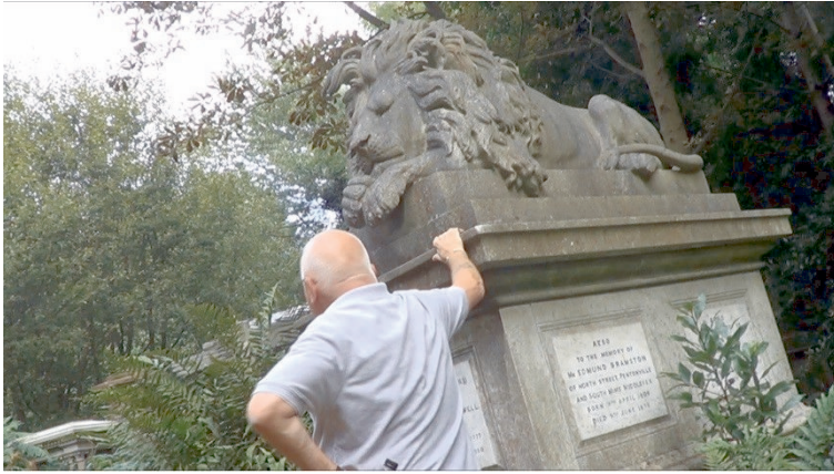
Fig. 10: The tombstone of George Wombwell with the lion Nero sleeping on the top of a sarcophagus.

they are often not directly connected to the materiality of the cemetery and could also be told on another occasion at a different place. In this way the narratives enlarge the cemetery's geographical space with the life stories of the people buried there. These stories are complemented with personal stories of the tour guide. For example in front of the grave of a person who recently passed away, Alexander Walterowitsch Litwinenko, member of the KGB, he mentions: «...they put some radioactive stuff into his tea, uhm, a lot of people say, was he safely buried here? He is, because it was a substitute of Pollonium 210...» 41 The TG tells his personal story about an Arsenal football game he attended where they had to close a whole section of the football stadium. The deceased was at a game in the same stadium before he died and according to the TG they feared «some radioactive stuff» in this section. By sharing these personal stories the TG connects successfully with the Ps.