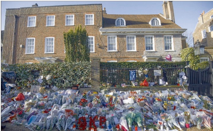
Fig. 1: A place for mourning in front of George Michael's house in Camden, London. 5

The example of George Michael's grave shows how the Trust regulates the cemetery's practices and usages. Obviously there is a private part in West Highgate that is not open to the public. The relatives' wishes may have formed part of the decision to make the grave non-accessible for visitors. But in addition the Friends of Highgate probably feared West Highgate Cemetery might become swamped by mourning fans, by their tributes and ultimately turning it into a place of mass pilgrimage as is the case with other tombs in East Highgate notably the grave of Karl Marx. 4 The Trust argues that there is not enough space to receive the tributes, which, on the one hand, is a little surprising given the spatial dimensions of the cemetery. On the other hand, however, the policy might be deemed reasonable remembering the pictures in the press of the huge piles of flowers, letters, candles and pictures among other things in front of George Michael's house in Camden (fig. 1).