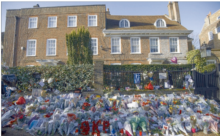
Fig. 1: A place for mourning in front of George Michael's house in Camden, London. 5

The example of George Michael's grave shows how the Trust regulates the cemetery's practices and usages. Obviously there is a private part in West Highgate that is not open to the public. The relatives' wishes may have formed part of the decision to make the grave non-accessible for visitors. But in addition the Friends of Highgate probably feared West Highgate Cemetery might become swamped by mourning fans, by their tributes and ultimately turning it into a place of mass pilgrimage as is the case with other tombs in East Highgate notably the grave of Karl Marx. 4 The Trust argues that there is not enough space to receive the tributes, which, on the one hand, is a little surprising given the spatial dimensions of the cemetery. On the other hand, however, the policy might be deemed reasonable remembering the pictures in the press of the huge piles of flowers, letters, candles and pictures among other things in front of George Michael's house in Camden (fig. 1).