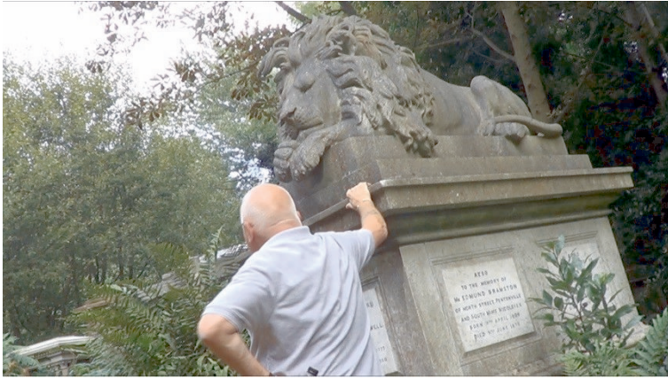
Fig. 10: The tombstone of George Wombwell with the lion Nero sleeping on the top of a sarcophagus.

they are often not directly connected to the materiality of the cemetery and could also be told on another occasion at a different place. In this way the narratives enlarge the cemetery's geographical space with the life stories of the people buried there. These stories are complemented with personal stories of the tour guide. For example in front of the grave of a person who recently passed away, Alexander Walterowitsch Litwinenko, member of the KGB, he mentions: «...they put some radioactive stuff into his tea, uhm, a lot of people say, was he safely buried here? He is, because it was a substitute of Pollonium 210...» 41 The TG tells his personal story about an Arsenal football game he attended where they had to close a whole section of the football stadium. The deceased was at a game in the same stadium before he died and according to the TG they feared «some radioactive stuff» in this section. By sharing these personal stories the TG connects successfully with the Ps.