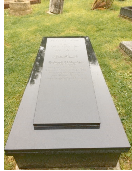
Fig. 7: Tomb of historian Eric Hobsbawm.