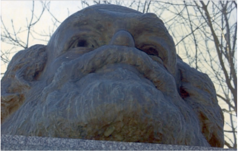
Fig. 12: The «massive head» of Karl Marx (Film still: High Hopes , 01:01:47).