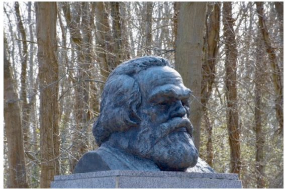
Figs. 5 and 6: The Karl Marx Memorial in Highgate Cemetery (Images: Daria Pezzoli-Olgiati 2018).

However, leaving aside clear differences in style, 47 there are two major differences with respect to Kerbel's sculpture. In the first place, it is located in