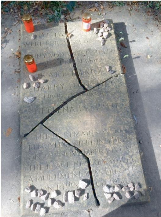
Fig. 4: The original burial place of Karl Marx with candles and stones left by visitors.

to a mythological figure of class struggle, a narratively constructed paladin of all the workers and exploited.