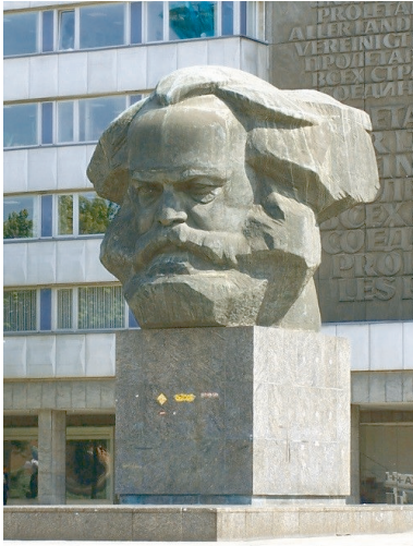
Fig. 2: Lew Kerbel's Karl Marx memorial in Chemnitz, formerly Karl-Marx-Stadt. 21

City alias Chemnitz, which conveys «a political-physiognomic message [...] that, beyond epoch-making allocation and beyond political conviction, emphasises the charisma and the unflinching will as decisive characteristics of a power-conscious political protagonist» 19 (fig. 2). Lev Kerbel's monument then also served as a model for souvenirs, which were made in countless variations in metal, porcelain and plastic. 20