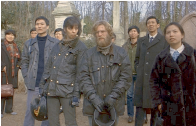
Fig. 11: Tourists looking at the Karl Marx Memorial (Film still: High Hopes, 01:02:30).

This scene, like the whole film, highlights in an almost caricatured way two completely different ways of approaching the world and life. On the one hand there is Cyril, who looks bitterly into the world and, despite holding to his moral and political convictions, has given up all hope. He