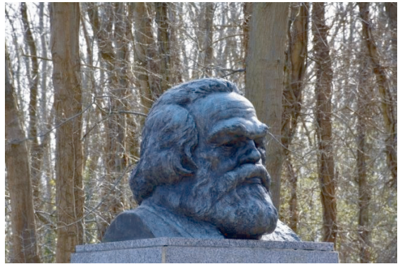
Figs. 5 and 6: The Karl Marx Memorial in Highgate Cemetery (Images: Daria Pezzoli-Oligati 2018).

However, leaving aside clear differences in style, 47 there are two major differences with respect to Kerbel's sculpture. In the first place, it is located in