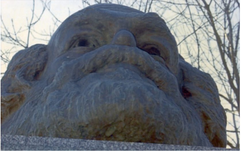
Fig. 12: The «massive head» of Karl Marx (Film still: High Hopes , 01:01:47).