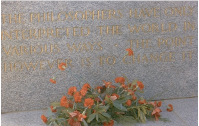
Fig. 13: Flowers at the bottom of the Karl Marx Memorial (Film still: High Hopes , 01:01:33).

In a sense, also Mike Leigh's film highlights a sort of quasi-religious veneration of the Marx icon by the protagonist Cyril. However, High Hopes