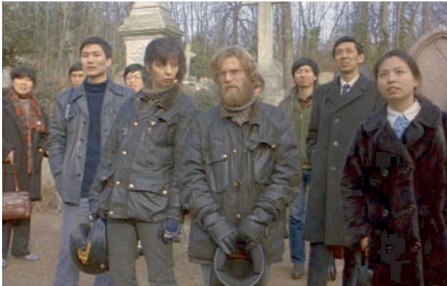
Fig. 11: Tourists looking at the Karl Marx Memorial (Film still: High Hopes, 01:02:30).

This scene, like the whole film, highlights in an almost caricatured way two completely different ways of approaching the world and life. On the one hand there is Cyril, who looks bitterly into the world and, despite holding to his moral and political convictions, has given up all hope. He