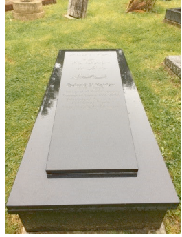
Fig. 7: Tomb of historian Eric Hobsbawm (Image: Daria Pezzoli-Olgati 2018).