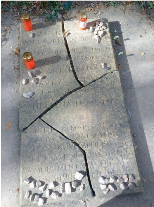
Fig. 4: The original burial place of Karl Marx with candles and stones left by visitors.

to a mythological figure of class struggle, a narratively constructed paladin of all the workers and exploited.