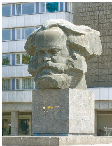
Fig. 2: Leu Kerbel's Karl Marx memorial in Chemnitz, formerly Karl-Marx-Stadt (Image: Wikimedia Commons). 21

City alias Chemnitz, which conveys «a political-physiognomic message [...] that, beyond epoch-making allocation and beyond political conviction, emphasises the charisma and the unflinching will as decisive characteristics of a power-conscious political protagonist» 19 (fig. 2). Lev Kerbel's monument then also served as a model for souvenirs, which were made in countless variations in metal, porcelain and plastic. 20