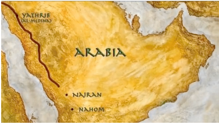
Fig. 159 A map with a red line that moves across the Arabian Peninsula is inserted to show Lehi's journey ( Journey of Faith , 00:33:26).