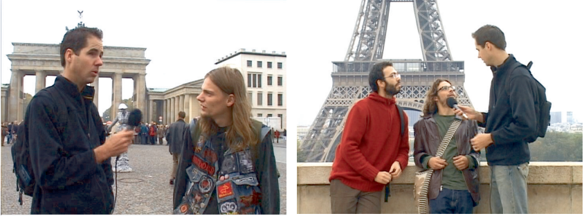
Fig. 119 The social actor responds seriously to the questions in a strong German accent, from Saxony. He seems ignorant for although the host does not speak his language, he outclasses the young German man with greater knowledge of Mormonism (American Mormon in Europe, 00:06:47).