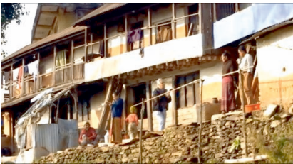
Fig. 134/ Fig. 135/ Fig. 136/ Fig. 137/ Fig. 138/ Fig. 139/ Fig. 140 Bishnu Adikari guides the camera through his world and provides access to private spaces that otherwise would be difficult to visit. His gaze becomes the camera's gaze (Meet the Mormons, 00:50:20/ 00:50:27/ 00:50:35/ 00:51:15/ 00:51:16/ 00:51:36/ 00:51:37).

As the protagonist tells his conversion story, the camera frames him in a close shot (fig. 134). The shot changes and Bishnu is shown alone in the landscape (fig. 135), suggesting a respectful distance is required at this important moment. Then the camera follows the dynamic protagonist (fig.