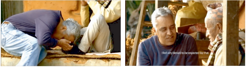
Fig. 153/ Fig. 154 At the end of section entitled The Humanitarian , the protagonist returns to his village, where he meets his father ( Meet the Mormons , 00:57:38/ 00:57:48).

with seemingly boundless energy – a summary of the message of this section is provided, as the very decent protagonist recounts (00:48:41): “I’m not close to the perfection but I’m perfect in one thing – I’m perfect in trying.” Not just his behavior but also his self-assessment is humble.