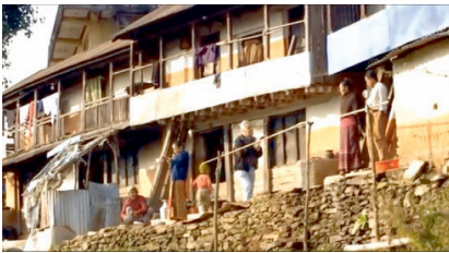
Fig. 134/ Fig. 135/ Fig. 136/ Fig. 137/ Fig. 138/ Fig. 139/ Fig. 140 Bishnu Adikari guides the camera through his world and provides access to private spaces that otherwise would be difficult to visit. His gaze becomes the camera's gaze (Meet the Mormons, 00:50:20/ 00:50:27/ 00:50:35/ 00:51:15/ 00:51:16/ 00:51:36/ 00:51:37).

As the protagonist tells his conversion story, the camera frames him in a close shot (fig. 134). The shot changes and Bishnu is shown alone in the landscape (fig. 135), suggesting a respectful distance is required at this important moment. Then the camera follows the dynamic protagonist (fig.