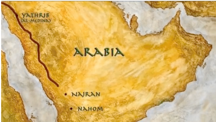
Fig. 159 A map with a red line that moves across the Arabian Peninsula is inserted to show Lehi's journey ( Journey of Faith , 00:33:26).