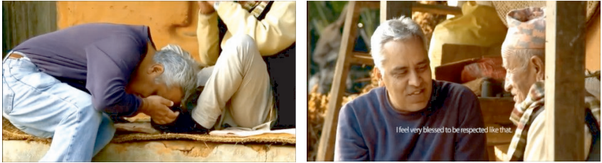
Fig. 153/ Fig. 154 At the end of section entitled The Humanitarian , the protagonist returns to his village, where he meets his father ( Meet the Mormons , 00:57:38/ 00:57:48).

with seemingly boundless energy – a summary of the message of this section is provided, as the very decent protagonist recounts (00:48:41): “I’m not close to the perfection but I’m perfect in one thing – I’m perfect in trying.” Not just his behavior but also his self-assessment is humble.