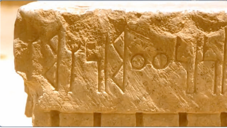
Fig. 160 The letters NHM are inscribed on this pillar. Joseph Smith could not have known of the city, which was not discovered until the 20 th century, yet it appears in The Book of Mormon ( Journey of Faith , 00:38:42).