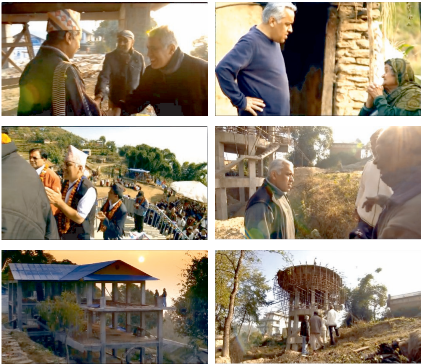
Fig. 141/ Fig. 142/ Fig. 143/ Fig. 144/ Fig. 145/ Fig. 146 The camera gaze follows a pattern whereby it is close and in the middle of the action and also provides the “bigger” picture, often of scenic surroundings (Meet the Mormons, 00:51:51/ 00:52:00/ 00:52:18/ 00:52:36 /00:52:09/ 00:52:40).

136) and becomes a passenger on board a plane (fig. 137), catching a view of the hills around Katmandu from above (fig. 138). The protagonist defines the camera gaze, showing where it should be directed, for example toward a mother and her two children when he greets them (fig. 139). The protagonist opens his world to the camera, which is able to enter unobtrusively. As a local, Adhikari enables the audience to access these private spaces. On occasion the camera adopts a beneficial distance, helping localize the plot spatially (fig. 140).