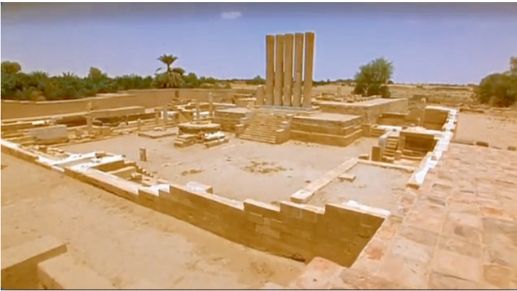
Fig. 161: The narration explains that three temples have been found on an archeologic site on which NHM is inscribed. The longshot of the archeological excavation should prove the existence of Nahom ( Journey of Faith , 00:38:59).

mon theology is a separate matter, but, the film suggests, archeological evidence supports the story of Lehi and therefore also The Book of Mormon . The evidence for Lehi's journey from Jerusalem to the sea is apparently overwhelming – no opposing voices are heard. The narrative appears both strong and authentic and suggests that the facts and belief are in accord. At