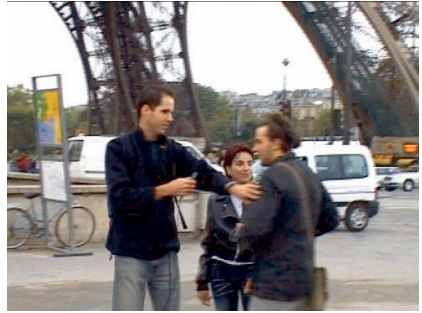
Fig. 117 That Tufts is the center of attention is expressed by his proximity to the camera. He even covers some of the social actors (American Mormon in Europe, 00:04:23).