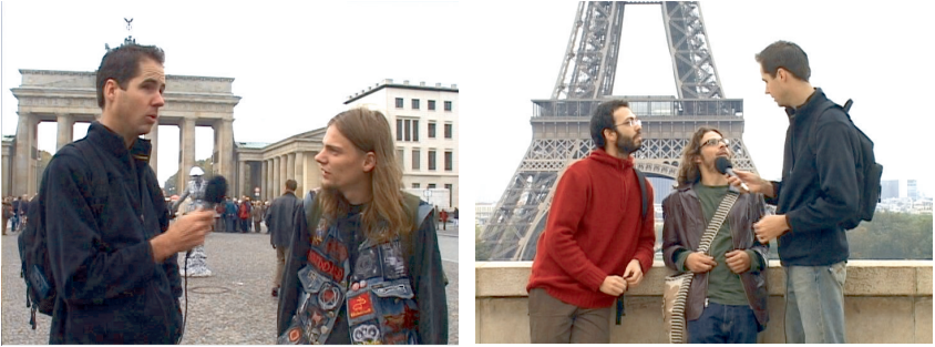
Fig. 119 The social actor responds seriously to the questions in a strong German accent, from Saxony. He seems ignorant for although the host does not speak his language, he outclasses the young German man with greater knowledge of Mormonism (American Mormon in Europe, 00:06:47).