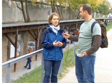
Fig. 123 The Italian Mormon in Rome faces straight on to the camera whereas Knudsen is turned away. Again the host's reactions and interventions are limited and very reluctant (American Mormon in Europe, 00:35:19).