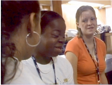
Fig. 87 The camera participates in the circle of love. The protagonists seem uncomfortable with the intimacy of the situation (Sisterz in Zion, 00:22:24).

practice is used to foster bonds between the participants. The camera is placed within the circle, as if itself a participant (Fig. 87–89).