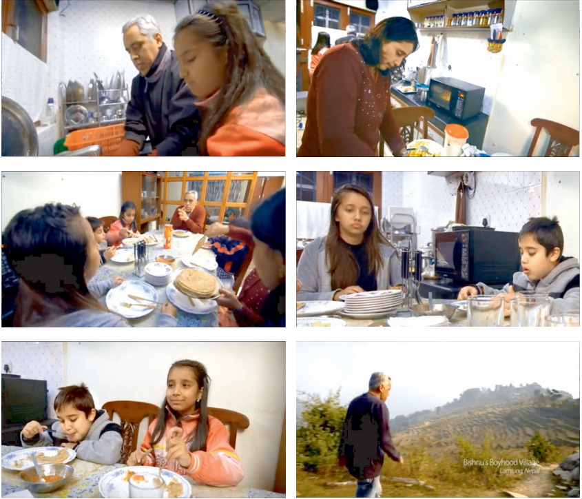
Fig. 128 The camera is invited to stay close to the Adhikari family ( Meet the Mormons , 00:49:15).