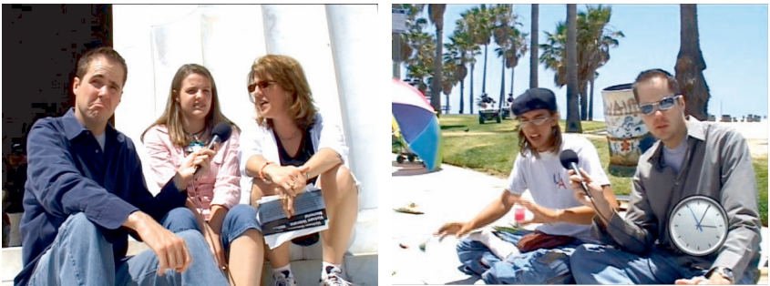
Fig. 111 Tufts reacts with a grimace as commentary on the social actor's answer that “Mormons are still churning butter” ( American Mormon , 00:08:12).

We can explore a number of scenes from American Mormon to establish how the camera is employed to comment on the social actors' answers. For example, when Tufts asks two women – probably mother and daughter – what they know about Mormons, the elder woman describes them as “backward”. Tufts asks, “Do Mormons use microphones?” The woman answers, “I think they are still churning butter.” Tufts comments on this answer by grimacing into the camera such that the social actors cannot see his response (fig. 111).