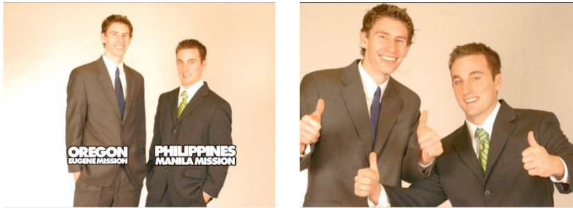
Fig. 115/ Fig. 116 In the end credits the two street musicians encountered in Las Vegas are presented as neatly dressed young men ready to serve their mission and as still having fun ( American Mormon in Europe , 00:33:35/ 00.33.40).

of the two men is inserted in which they are neatly and tidily dressed in the suits of missionaries (fig. 115/116).