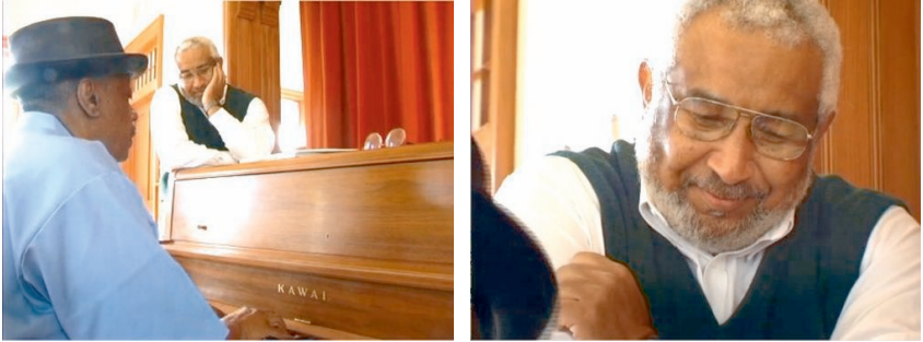
Fig. 104 / Fig. 105 Director Gray becomes focus of the narration. It is also his story that has been told (Nobody Knows, 01:08:54/ 01:09:07).