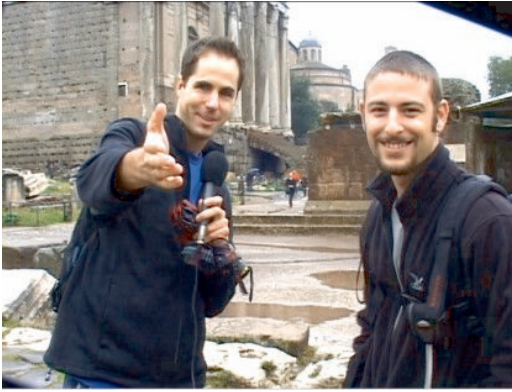
Fig. 127 When Tufts explains that they are Mormons, people respond with surprise and sometimes with embarrassment at their own previous comments ( American Mormon in Europe , 00:47:24).

words, she starts to cry. Tufts again interrupts and comments and Knudsen listens.