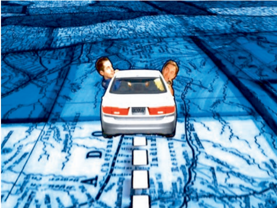
Fig. 108 The music accompanying the opening credits announces the documentary mode as funny and light-hearted ( American Mormon , 00:01:28).

The opening titles and their cartoon style can be understood as helping the audience understand the two Mormon protagonists as comic figures (fig. 108): they travel the United States in their white car accompanied by a peppy music score with a dominant electric rock guitar.