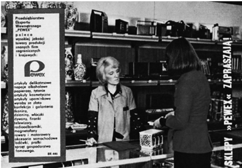
pic. 3: An original 1980s advertisement of Pewex stores from a weekly magazine “Motor”.