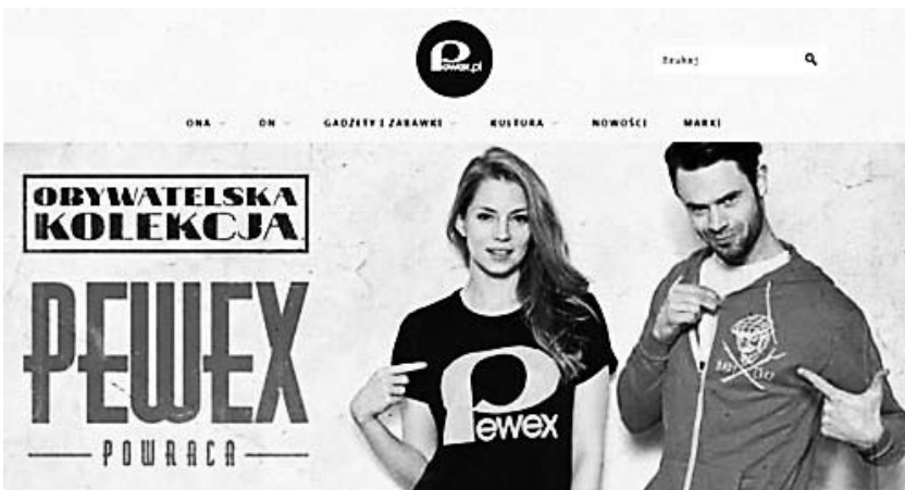
pic. 4: The main page of the Pewex.pl store with an advertisement of the ‘citizen’s collection’ which includes clothing with the Pewex logo