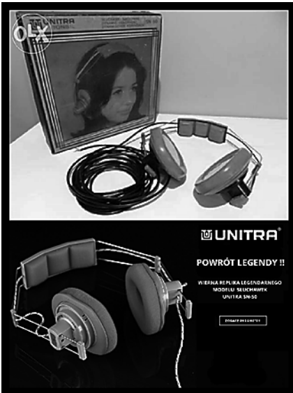
pic. 2: Original Unitra Sn-50 headphones and their 2014 counterpart advertised by the producer as a “faithful replica”.

(source: http://www.sklepunitra.pl/ ; http://olx.pl/oferta/sluchawki-unitra-sn50-orginaln-e-opakowanie-z-gwarancja-z-1975r-CID99-IDaMohh.html#a7499357c9 )