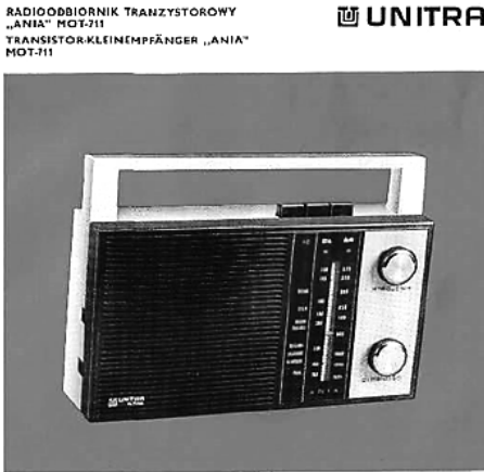
pic. 1: An original advertisement of an Unitra radio set.