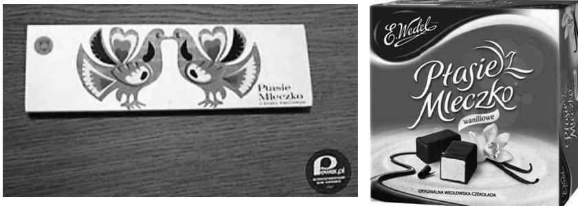
pic. 8: Ptasie Mleczko then and now.