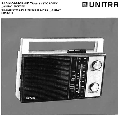
pic. 1: An original advertisement of an Unitra radio set.