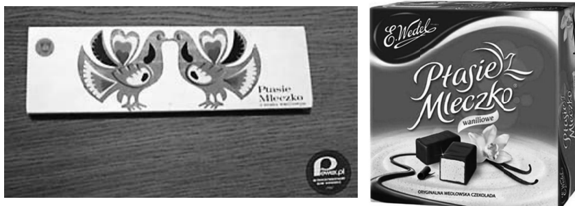
pic. 8: Ptasie Mleczko then and now.