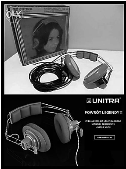
pic. 2: Original Unitra Sn-50 headphones and their 2014 counterpart advertised by the producer as a “faithful replica”.