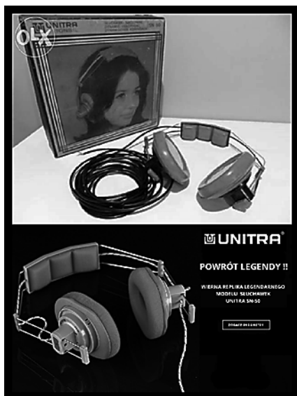
pic. 2: Original Unitra Sn-50 headphones and their 2014 counterpart advertised by the producer as a "faithful replica".