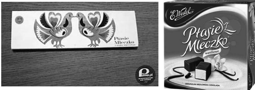
pic. 8: Ptasie Mleczko then and now.