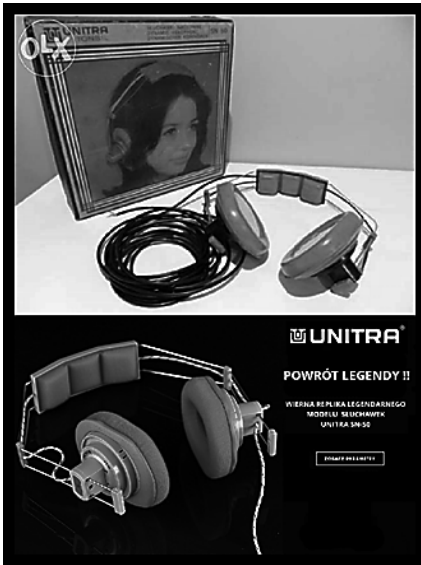
pic. 2: Original Unitra Sn-50 headphones and their 2014 counterpart advertised by the producer as a “faithful replica”.