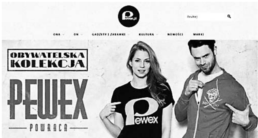
pic. 4: The main page of the Pewex.pl store with an advertisement of the ‘citizen’s collection’ which includes clothing with the Pewex logo