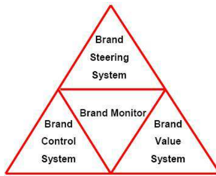
Figure 3.3: The four modules of the ACNielsen Brand Performance System (source: Franzen, Markenbewertung , p. 13.).

based on a point score model. 498 Ten indicators in four categories are utilised in order to operationalise brand strength. These categories are market attractiveness (represented by market volume and market growth), penetration of the brand within the market (shown on the basis of current status and growth of market share (both in absolute and relative figures)), acceptance of the brand on the demand side (represented by brand awareness and existence of the brand in the so-called relevant set 499 ) and distribution rate of the brand. 500 The figures determined for each indicator are then transformed into a point score, whereupon the resulting scores are weighted with pre-defined factors 501 and as a next step totalled and scaled so that a maximum of 100 points can be attained. 502 The achieved percentage of this maximum score represents the absolute brand strength.