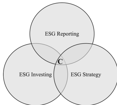
Figure 1: ESG Convergence (own illustration)

In an ideal world , the market participants of the ESG ecosystem would collaborate as outlined below in the joint pursuit to maximize the Convergence of ESG ('C') in the illustration above. The following abstract briefly explains the (ideal) role of every participant in the ESG ecosystem and highlights their respective demand and supply side as well as their core activities for ESG integration.