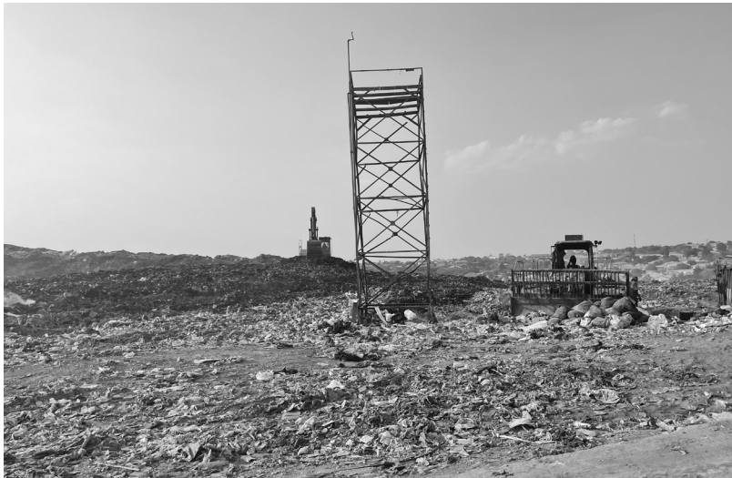
Fig. 15: Equipment Chunga landfill, Lusaka, October 2022

Legal and illegal landfills exist in Lusaka. The majority of franchise contractors transport their unsorted waste to Lusaka's largest landfill: Chunga landfill. The site covers an area of 24,53 hectare and it is controlled by the LCC (cf. Milimo et al. 2021: 571). It was built in 2004 and designed for 25 years but will be in place for the next 50 years (cf. Milimo et al. 2021: 571; LCC, personal interview, LCC, Chunga Landfill, Lusaka, 17.10.22, see Annexure 7). The Chunga site is not currently fenced in entirety due to the need to facilitate access because of weather conditions and the covid pandemic. At the landfill, work is done with simple-looking equipment (see Fig. 15:). There are clear ideas for the optimization of this landfill, such as the rebuilding of the fence, the construction of a new road within the landfill or even the closure of an old area (LCC, personal interview, LCC, Chunga Landfill, Lusaka, 17.10.22, see Annexure 7). Most of the people seen at the dump are waste pickers who make their living by sorting and selling waste (see 4.3.5). There are efforts to register these waste pickers and charge an entry fee of 2 ZMW/day . However, both of these efforts are incomplete in reality due to implementation capacities and suitable tools (e. g., manual paper-based registration of waste pickers).