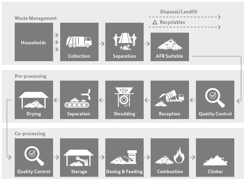
Fig. 18: Pre- and Co-processing within MSW management (cf. Holcim 2020: 29)

tic waste in the co-processing of cement production is clearly superior to conventional incineration – because the high temperatures and long residence time in the rotary kiln destroy pollutants, fully utilize the heat content, and no ash or other residues remain that have to be disposed of in a landfill (cf. GIZ-LafargeHolcim 2020: 1–35; Holcim n. d.; European Union 2020). Although incineration is not the single solution to overall waste management, it provides a reasonable element to manage Lusaka's current waste (see Fig. 18).