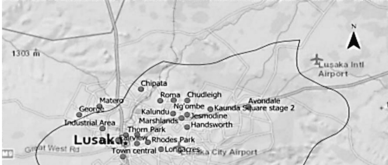
Fig. 16: Waste collection sites (dots) in Lusaka, Zambia (cf. Sambo et al. 2020: 43)

In addition to this large landfill where about 50 % of Lusaka's potential waste, there are also other collection points (see Fig. 16). At the Chunga landfill site, trucks with their loads are weighed at the entrance. The private waste collectors have to pay a fee of 50 ZMW/t the CBE pay less e.g., 200 ZMW for 16–20 t (details see Tab. 9).