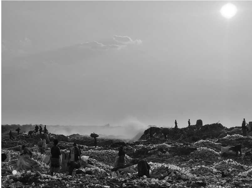
Fig. 11: Chunga landfill, Lusaka, October 2022

serve this growth due to various aspects (details as follows). In addition to the quantities, the problem of the composition of the waste has also emerged, as the increasing quantities of plastic are unmanageable as seen on site (see Fig. 11:). These challenges are well known in Lusaka and are already partly addressed in the SWIMP by increasing the recycling rate (SG 8). Furthermore, it might be challenging to take producers into account for optimizing the waste management.