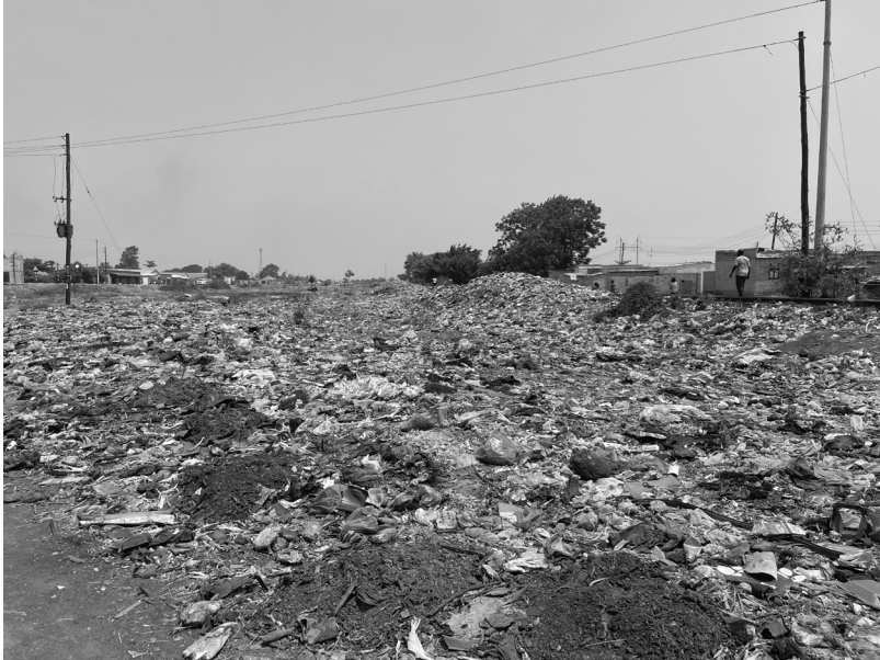
Fig. 17: Misisi, Lusaka, October 2022

at illegal landfills compared to Chunga Landfill (cf. Recycler 2, personal interview, Lusaka, 22.10.22 see Annexure 6). This difference in quality can be attributed to the length of time the waste has been lying around and thus to its contamination. The waste quality though has a high relevance for recyclers and waste pickers (see chapter 4.3.5).