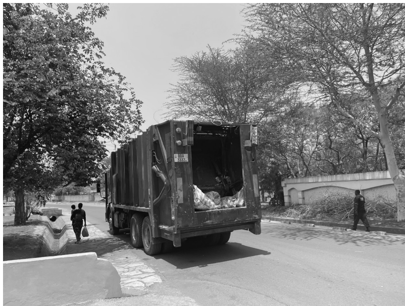
Fig. 13: House-to-House collection Kabulonga, October 2022 (own image)

In order to offer the waste collection service, the waste collectors must be registered. This registration costs 15.000 ZMW/year and is issued for a period of four years by the relevant official body which is currently not clearly defined. This licensing process also includes a quality control of the waste collector's equipment (cf. Waste Collector 1, personal interview, Lusaka, 17.10.22, see Annexure 3) In addition to waste collection and transport, waste collectors are also responsible for invoicing households, which have to pay a certain collection fee depending on the district (cf. UN Habitat 2010: 34). The waste fee is based on the district's distance from the Chunga Landfill as well as the district's economic strength and has a range of 50 ZMW/month – 250 ZMW/month (cf. Daka, & Madi-musta 2020: 532; LCC, personal interview, LCC, Chunga Landfill, Lusaka, 17.10.22, see Annexure 7) see Tab. 7:).