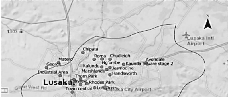
Fig. 16: Waste collection sites (dots) in Lusaka, Zambia (cf. Sambo et al. 2020: 43)

In addition to this large landfill where about 50 % of Lusaka's potential waste, there are also other collection points (see Fig. 16). At the Chunga landfill site, trucks with their loads are weighed at the entrance. The private waste collectors have to pay a fee of 50 ZMW/t the CBE pay less e.g., 200 ZMW for 16–20 t (details see Tab. 9).