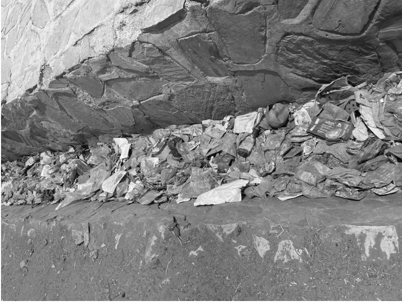
Fig. 1: Blocked sewer, Misisi, Lusaka, October 2022

And even though the impacts are felt locally in the city and need to be resolved, it is also important to involve international and national actors and their requirements (cf. Taylor 2000: 408). Dealing with MSW is also addressed directly and indirectly in the international 17 United Nations (UN) Sustainable Development Goals (SDGs) e. g., in SDG 6: Clean water or sanitation or SDG 12: Responsible consumption and production (cf. UN in Zambia n. d.). To achieve the SDGs, global and local actions must be implemented. An overview of the concrete targets in Lusaka and their impact on the SDGs can be found in the Annexure 9). Also various national initiatives address this complex waste topic either through the objective of a sustainable economy: “Africa by 2063 will have been transformed such that natural resources will be sustainably managed and the integrity and diversity of Africa’s ecosystems conserved” (African Union Commission 2015: 34) or directly as a defined goal “We, therefore, undertake to achieve (...) interconnected (...) Circular Economies that are sustainably developed (...)” (Southern African Development Community (SADC) 2020: 5).