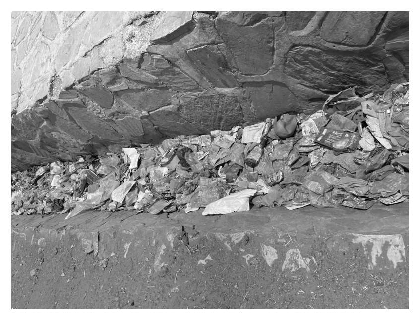
Fig. 1: Blocked sewer, Misisi, Lusaka, October 2022

And even though the impacts are felt locally in the city and need to be resolved, it is also important to involve international and national actors and their requirements (cf. Taylor 2000: 408). Dealing with MSW is also addressed directly and indirectly in the international 17 United Nations (UN) Sustainable Development Goals (SDGs) e.g., in SDG 6: Clean water or sanitation or SDG 12: Responsible consumption and production (cf. UN in Zambia n. d.). To achieve the SDGs, global and local actions must be implemented. An overview of the concrete targets in Lusaka and their impact on the SDGs can be found in the Annexure 9). Also various national initiatives address this complex waste topic either through the objective of a sustainable economy: "Africa by 2063 will have been transformed such that natural resources will be sustainably managed and the integrity and diversity of Africa's ecosystems conserved" (African Union Commission 2015: 34) or directly as a defined goal "We, therefore, undertake to achieve (...) interconnected (...) Circular Economies that are sustainably developed (...)" (Southern African Development Community (SADC) 2020: 5).