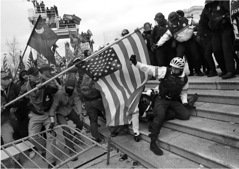
Figure 2: Trump supporters outside the U.S. Capitol on January 6, 2021.

In the former case, secessionist Southerners did not represent a noble ‘lost cause’ in what supporters continue to refer to as the ‘War between the States’ rather than the Civil War, thus belying the realities of slavery and its legacy in Jim Crow laws, systemic racism, regularized violence against Black life, and continuous microaggressions against Blacks and persons of color in the U.S. today. In the latter case, so-called Reich citizens believe that Germany was never defeated in WW II; thus, Germany’s borders from 1937 remain in place, and the ‘grand’ empire was never lost. According to this narrative, Germany is still occupied by foreign Allied forces, and therefore the current government has no legitimacy. Far-right German Corona protesters and the violent insurrectionists from January 2021 expressed racist, anti-immigrant, anti-feminist and anti-Semitic views. Members of both groups were inspired by the rhetoric of former president Donald Trump to commit illegal actions. 8 For example, the Camp-Auschwitz