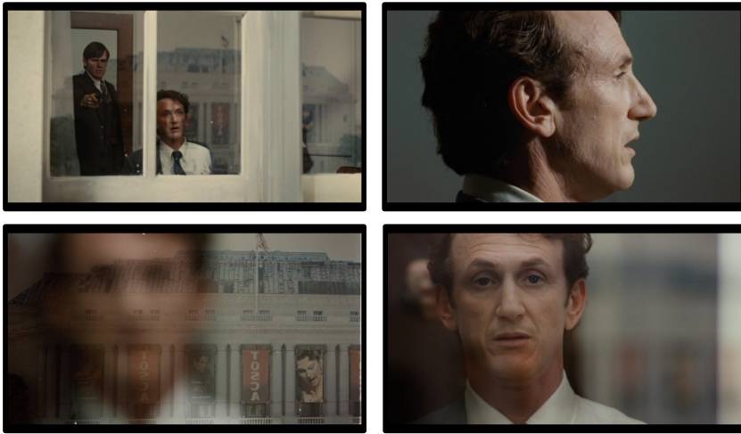
Figure 10: Milk's assassination (f.l.t.r. 01:51:07, 01:51:14, 01:51:20, 01:51:34)