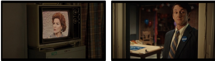
Figure 6: Bryant on TV (00:35:26 & 00:35:30)

perspective, they are set into the context of the life-threatening struggle the LGBTQIAN+ characters lead for their equality. Not only does this enhance a gay sensibility that the film seeks to convey, but also marks another offer to identify with Milk by suggesting his motives for fighting back Bryant's and Brigg's political campaign against homosexuals. Interestingly, despite following a clear good-versus-evil scheme that is innate to Hollywood films, directing the gaze towards the vindicators of the heteronormative system reverses the long tradition of the gay villain trope in cinema (cf. Russo 122). Questioning homophobic viewing habits, this gaze can hence be described as queer.